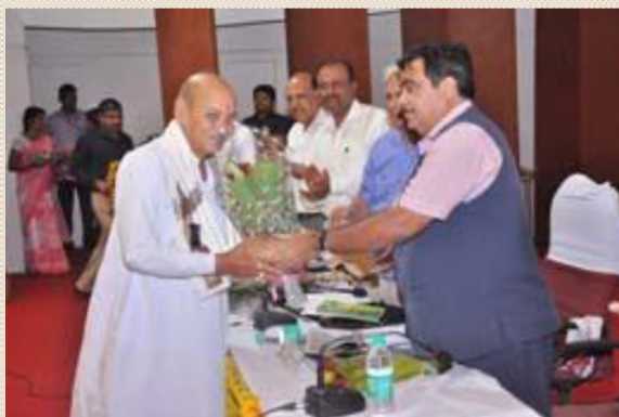
Shri Nitin Gadkari, Union Minister felicitating a farmer supplying biomass for value addition