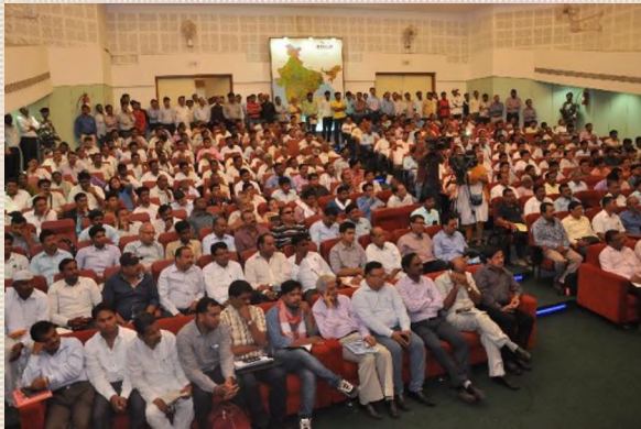
Delegates and farmers at the seminar