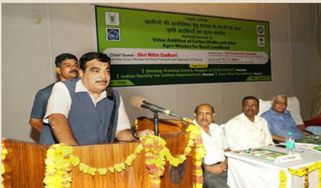
Shri. Nitin Gadkari, Hon’ble Union Minister for Road Transport, Highways & Shipping delivering the inaugural address

Books and Leaflets published by ICAR-CIRCOT, Mumbai and ICAR-NBSS&LUP, Nagpur were released on the occasion. The National Seminar was organised by GTC, Nagpur in collaboration with Indian Society for Cotton Improvement (ISCI) and Agro-Plus Foundation. More than 350 delegates including farmers, raw material suppliers, machine manufactures, marketing agencies and bank participated in the seminar.