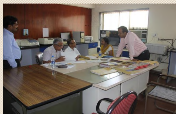
Expert committee members discussion with scientists during the audit