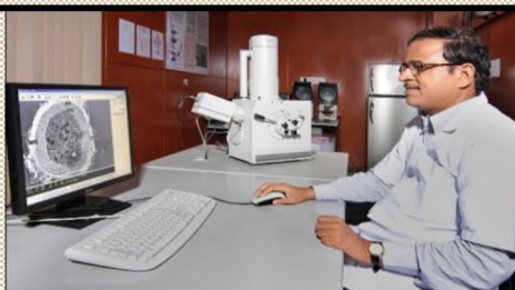
SCANNING ELECTRON MICROSCOPE