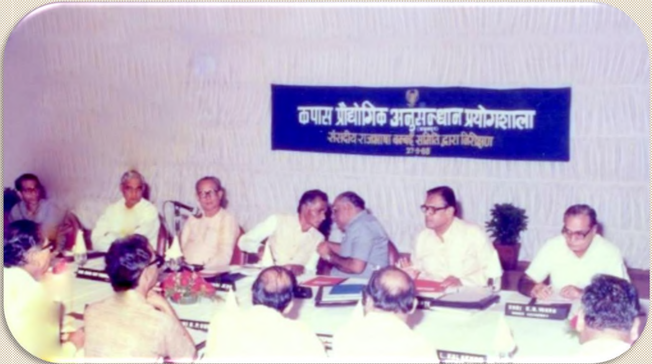
Bharat Ratna Shri. Atal Bihari Vajpayee, the former Prime Minister of India, visited the Institute which at that time was known as Central Technological Research Laboratory, Mumbai on 29 th September, 1988 for review of activities related to implementation of Rajbhasha