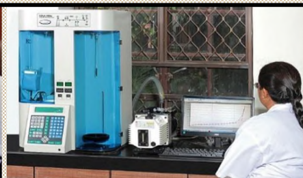
BET SURFACE AREA ANALYSER