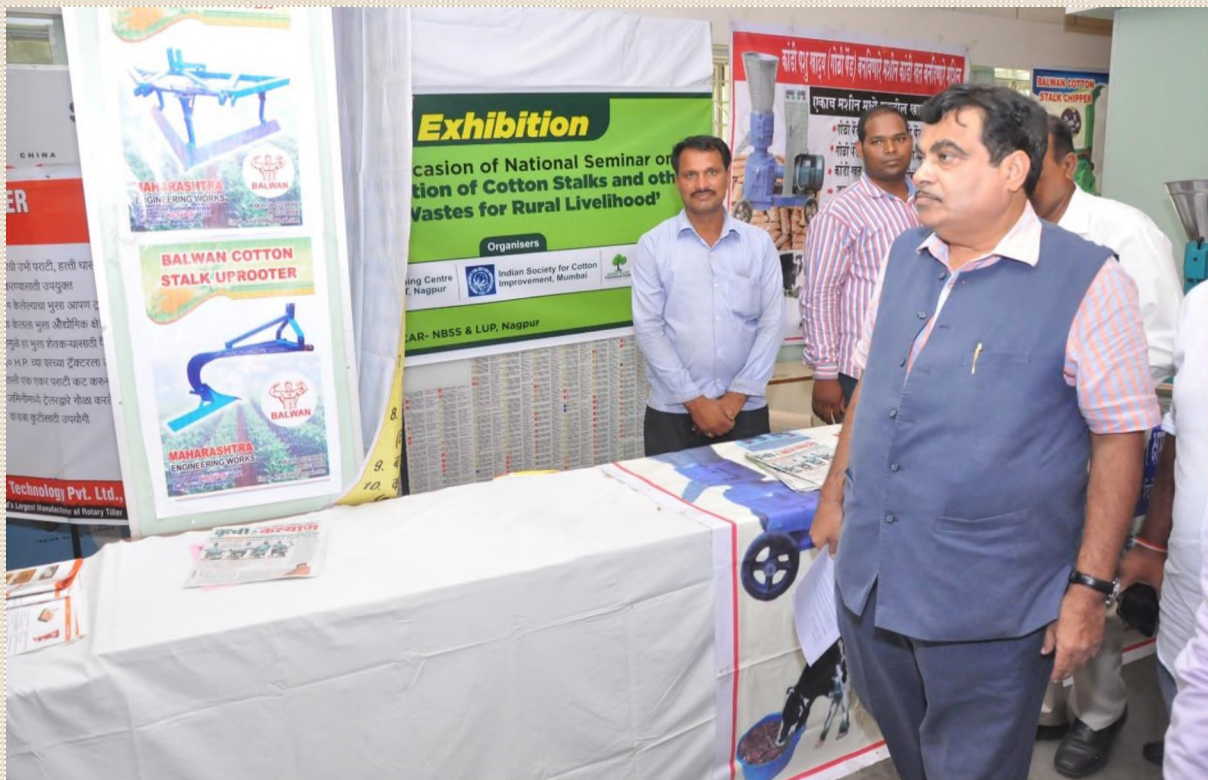
Shri Nitin Gadkari, Union Minister at the Exhibition