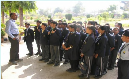
Students Visit at GTC Nagpur

Student's Visit at Coimbatore Regional Station Demonstration of HVI and AFIS for evaluation of major cotton fibre quality parameters were explained to 15 PhD students from Department of Plant Breeding and Genetics, TNAU, Coimbatore on 23 rd January, 2015.