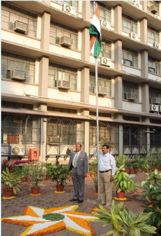
Hoisting of national flag by Director, CIRCOT