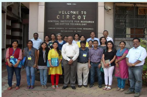
Group Photo: Training on Advances in Microscopy

A three day training programme on Advances in Microscopy was conducted from 19 th to 21 st January, 2015. This self-sponsored training programme was attended by ten participants from various states (Karnataka, Tamil Nadu, Himachal Pradesh, Assam and Maharashtra).