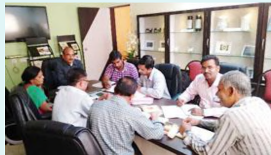
Hindi learning class

Under the Hindi Teaching Scheme, four staff members in Prabodh, nine in Praveen and one in Pragya are undergoing training at the Institute from January 15, 2015.