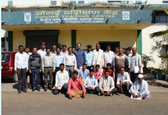
Group Photo: Farmers Training at GTC Nagpur

A five days farmers training course was conducted at Ginning Training Centre (GTC), Nagpur during 27 th to 31 st January, 2015. There were twenty three farmers from Jalna (MS), participated in the training program. Eminent speakers with expertise in cotton production and processing delivered the lectures. The training imparted theoretical and hands on training on proper cotton picking practices, importance of fibre quality parameters, by-product utilization, marketing, cotton processing and composting from cotton stalk etc.