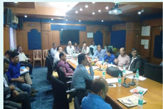
CRP on Natural fibres project meeting with all Principal Investigator's