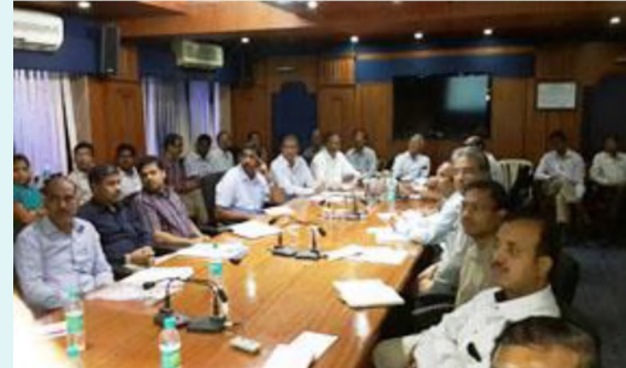
CRP on Natural fibres project meeting with CIRCOT scientist

be implemented by CIRCOT under CRP-Natural fibres. Based on the suggestions, Research projects are modified to achieve the desired results.