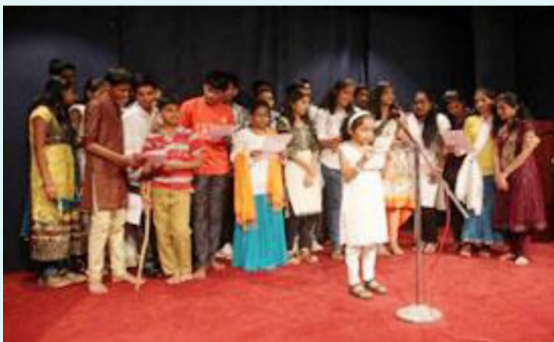
Children Performing Cultural programme