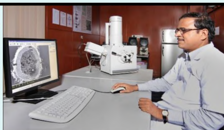
SCANNING ELECTRON MICROSCOPE