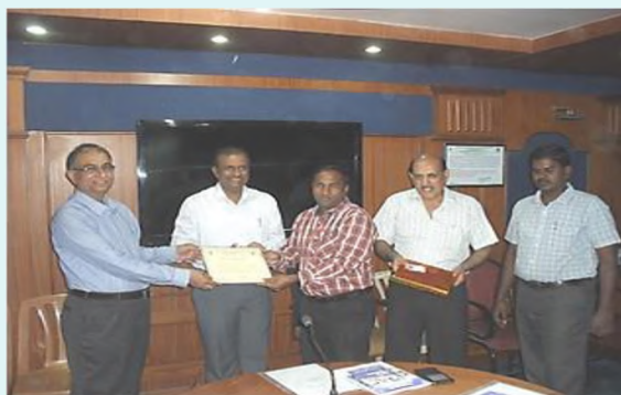
Valedictory Function of Training on Cotton Spinning