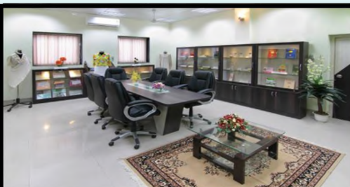
EXHIBITION CUM VISITORS' ROOM