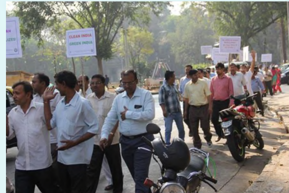
ICAR-CIRCOT Padyatra through Matunga, Mumbai

The staff of the Institute took out a padyatra from the institute through the Matunga area carrying with the banners and placards to create awareness in the citizens for a cleaner India. The institute staff members formed a human chain and removed the old files from the basement area of MS building for disposed on 27 th January, 2015.