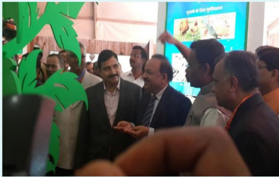
Shri Harshvardhan, Union Minister of Science and Technology at ICAR Exhibition Stall