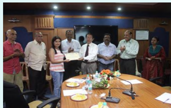
Valedictory function of Training on Advances in Microscopy

He emphasized the recent advances in analytical tool for pollutants identification much less than at the ppb level, high-resolution and high-speed camera, rapid detection of diseases by microscopy and the relevance of Moore's law in various technologies. He distributed certificates to the participants.