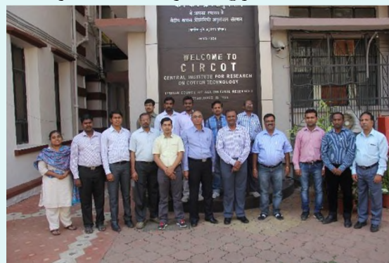
Group photo: Training on Cotton Spinning

A five day training programme on Cotton Spinning was organized at ICAR-CIRCOT, Mumbai from 5 th to 9 th January, 2015. The main objective of the programme was to update the knowledge and skills of trainee delegates in cotton spinning and cotton quality parameters, both in theory and practical mode and to keep abreast about the latest techniques and development in the spinning processes.