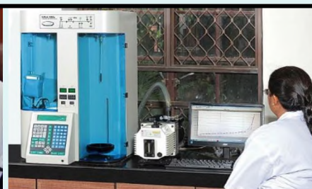
BET SURFACE AREA ANALYSER