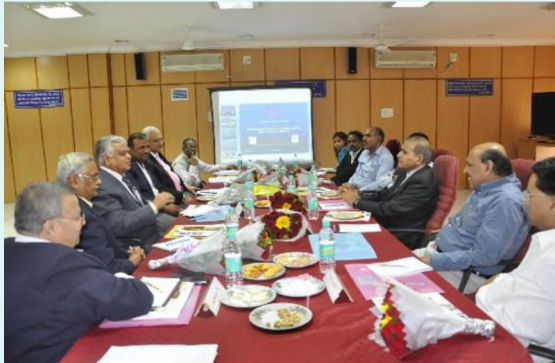
Advisory Committee Meeting for upgradation of GTC

The high level meeting was held at GTC, Nagpur during 12 th & 13 th January, 2015 to discuss regarding upgradation of the GTC to International centre catering to the research and training on ginning and biomass management.