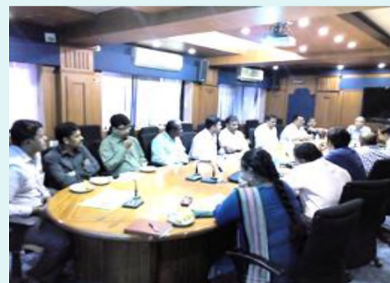
Inaugural function of training on Cotton Spinning

The training course imparted knowledge through lectures on the aspects of cotton quality evaluation, ginning, basics of spinning technology and machineries, new and advanced spinning systems, post spinning operations, cost and financial analysis of spinning industry. The course also covered practicals on fibre testing, micro and full spinning and new spinning techniques. A spinning mill visit was also arranged.