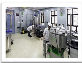
Nanocellulose Pilot Plant

Nanotechnology deals with the manipulation of atoms, molecules, or molecular clusters into functional structures to create functional materials and devices of vastly different properties. The first use of the concept of 'nanotechnology' was in " There's Plenty of Room at the Bottom ", a talk given by physicist Richard Feynman in 1959. ICAR-CIRCOT, a leader in the field of nanotechnology applications in agriculture & allied sectors, cotton textiles, pulp & paper, sensors and biocomposites, has over two decades of experience and expertise in nanomaterials synthesis, characterization and applications. In 2015, India's first Nanocellulose Pilot Plant was commissioned and dedicated to the nation. This nanotechnology training, 22 nd in the series , is being organized to impart basic and advanced knowledge of nanotechnology and its applications in agriculture and allied sectors. The Ministry of Agriculture & Farmers' Welfare authorizes ICAR-CIRCOT, Mumbai for nanofertilizer testing.