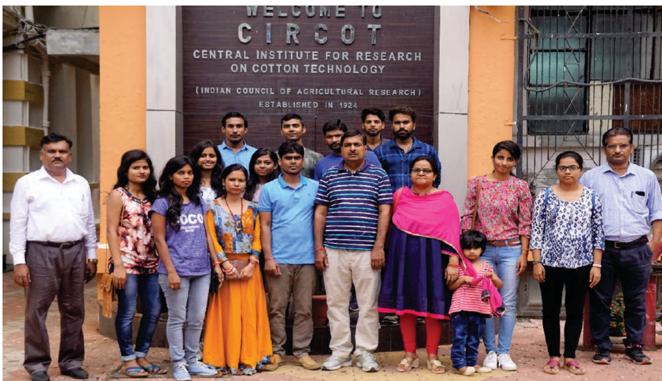
Students of Bihar Agricultural University, Sabour at ICAR-CIRCOT Mumbai