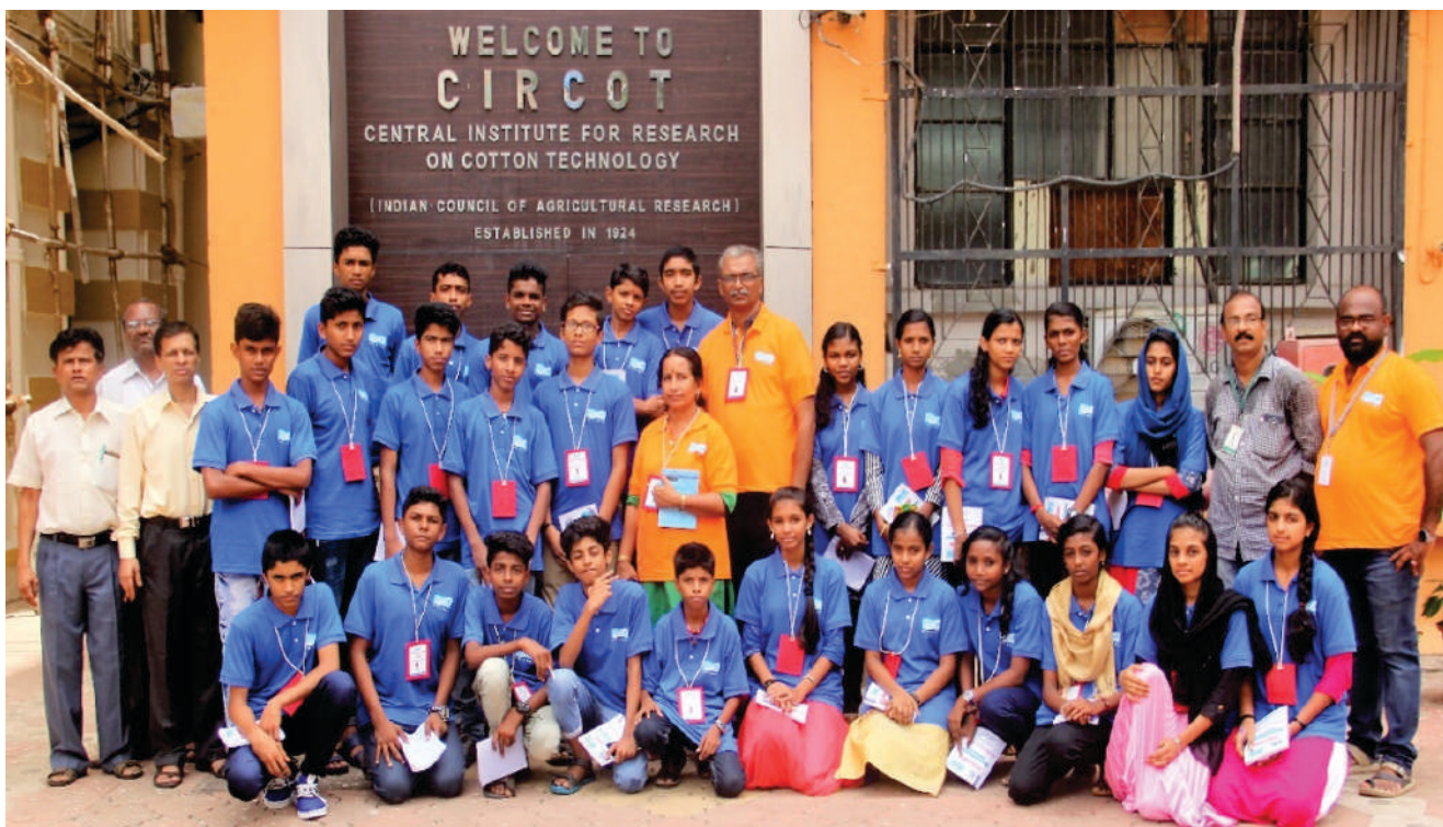
Students of Talent Search Programme Kerala at ICAR-CIRCOT Mumbai