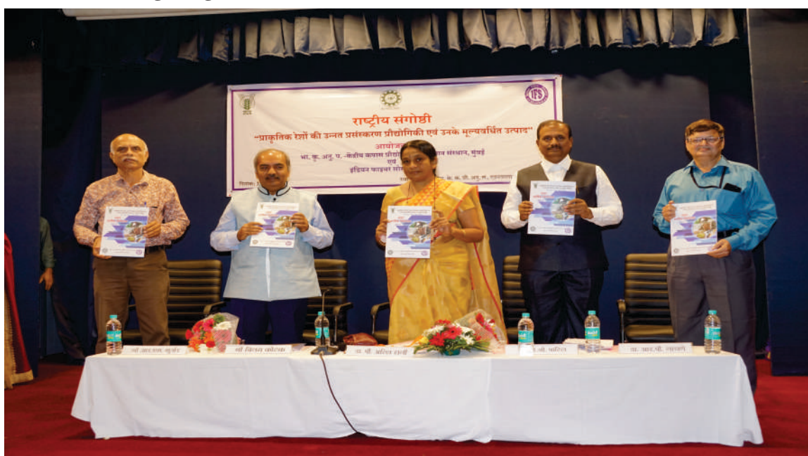
Release of Annual Special Issue of Hindi Magazine 'Ambar-2017' on 'Advanced Processing Technology of Natural Fibres and their Value Added Products'