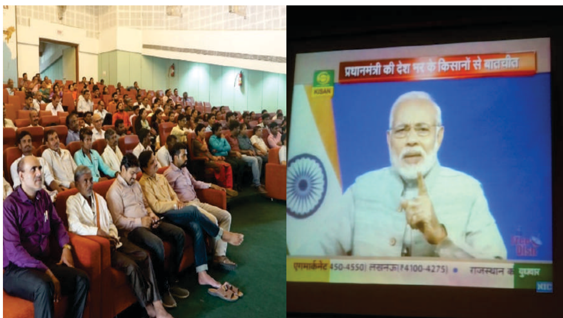
Hon'ble Prime Minister's interaction with farmers through video-conferencing at GTC, Nagpur on June 20, 2018

different regions in the program provided the knowledge base on newer crop management practices and motivated the fellow participants and farmers to bring a positive change in the current farming scenario towards the prosperity of nation.