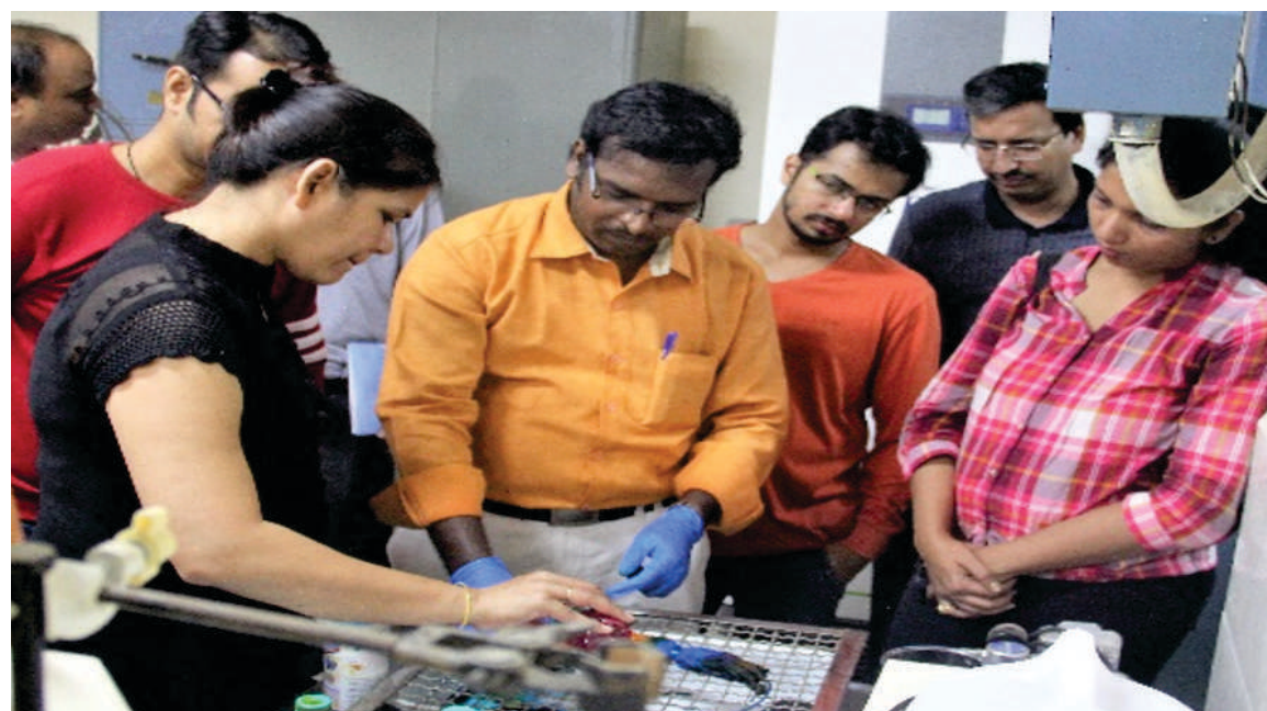
hands-on-training during Training Programme on 'Knitting & Knit Garments'