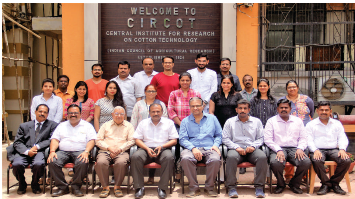
Group Photo Training Programme on 'Knitting & Knit Garments'