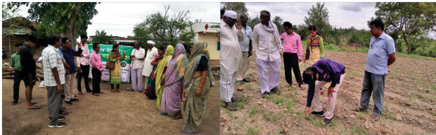
Field visit during awareness programme organized at village Dorli, Dist. Wardha

method of mushroom production from cotton waste at village level.