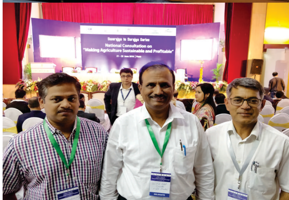
Director, ICAR-CIRCOT & Senior Scientists during National Consultation Programme