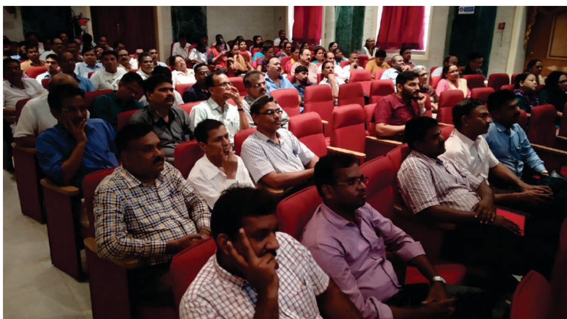
Live telecast of Hon'ble Prime Minister's interaction with farmers watched by staff of ICAR-CIRCOT Mumbai on June 20, 2018