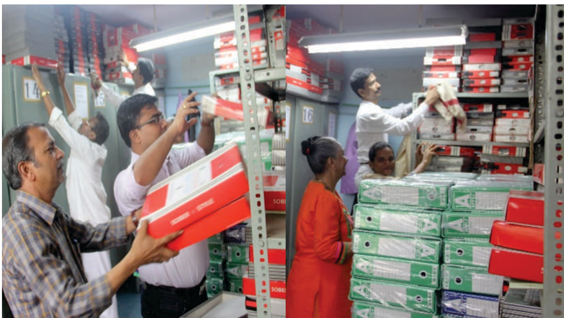
Admn IV & Admn V staff in cleaning programme

on June 21, 2018. All the staff members of both the sections participated enthusiastically in the cleaning activities.