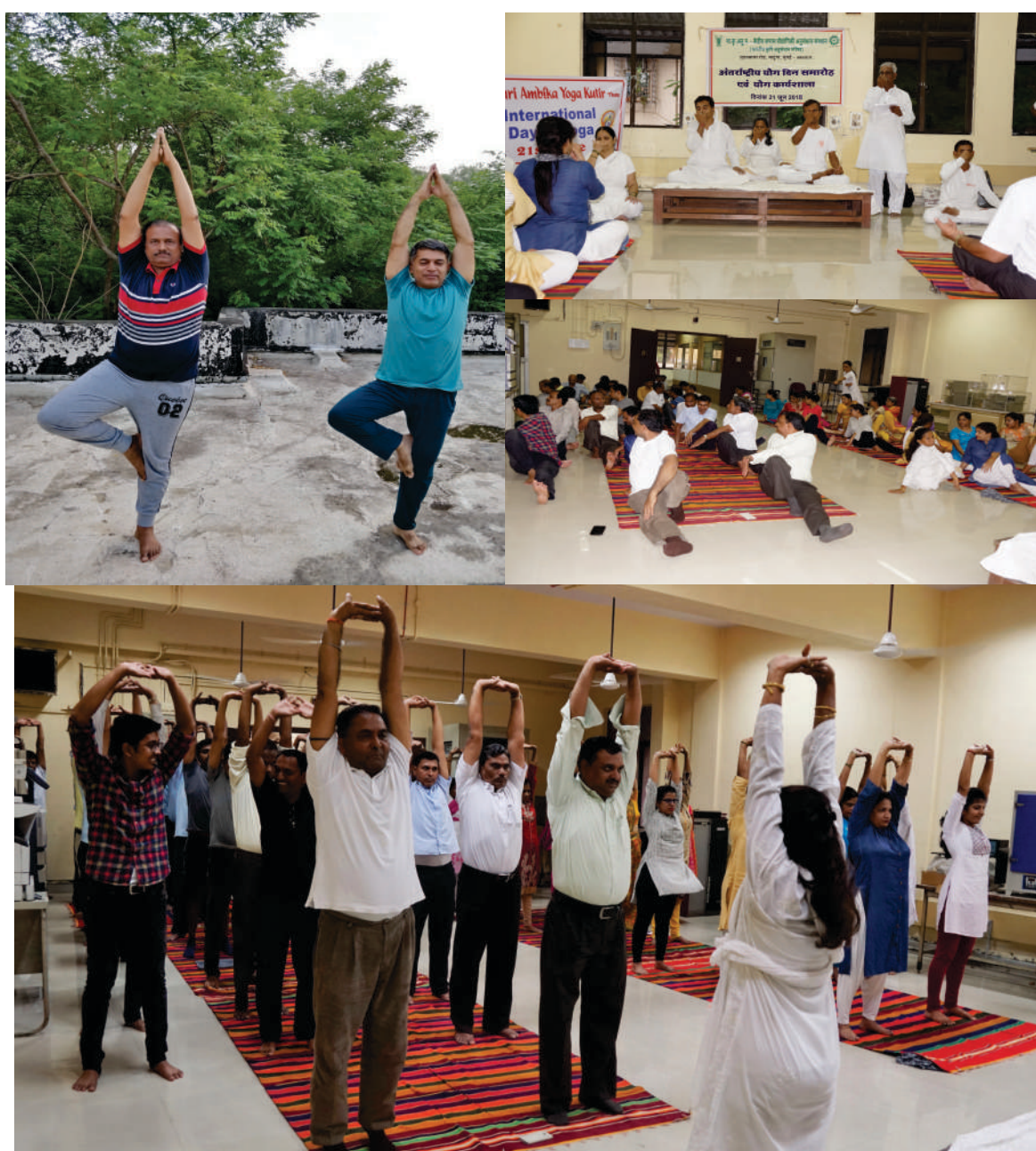
International Yoga Day celebration at ICAR-CIRCOT Mumbai

briefed about the importance of yoga and thereafter yogasanas were performed by all the staff members under the guidance of the instructors as per the protocol from Ayush Mantralaya. Along with Sanchalak, ten demonstrators/instructors were present to guide all the staff (65) members while performing yogasanas.