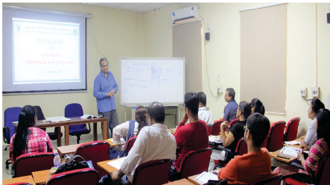
Presentations during Training Programme on 'Knitting & Knit Garments'