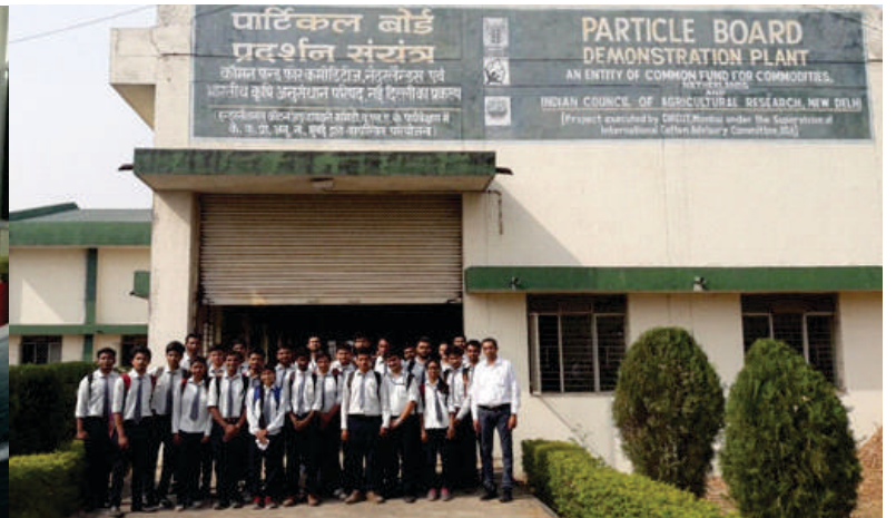
Students of S. B. Jain Institute of Technology, Management and Research visited GTC, Nagpur