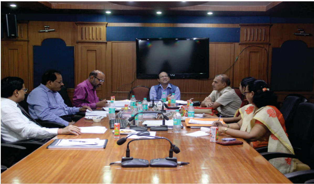
9 th QRT meeting being held at ICAR-CIRCOT