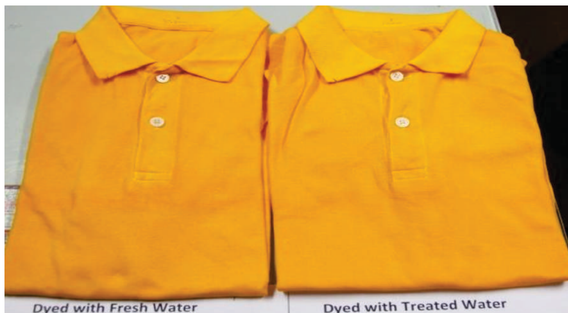
Fabrics dyed with treated and fresh water

along with a control dyeing using fresh water. The k/s value of the dyed fabric using treated water was 16.2 whereas that of fresh water dyed fabric was 18. There is no significant difference between the treated water and fresh water in terms of colour coordinates. The activated carbon based process can be used for removing the residual colour of the reactive dye effluent and the treated water can be reused for dyeing leading to water saving in textile dyeing process.