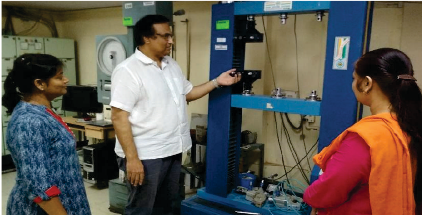
Trainees being demonstrated textile testing instruments