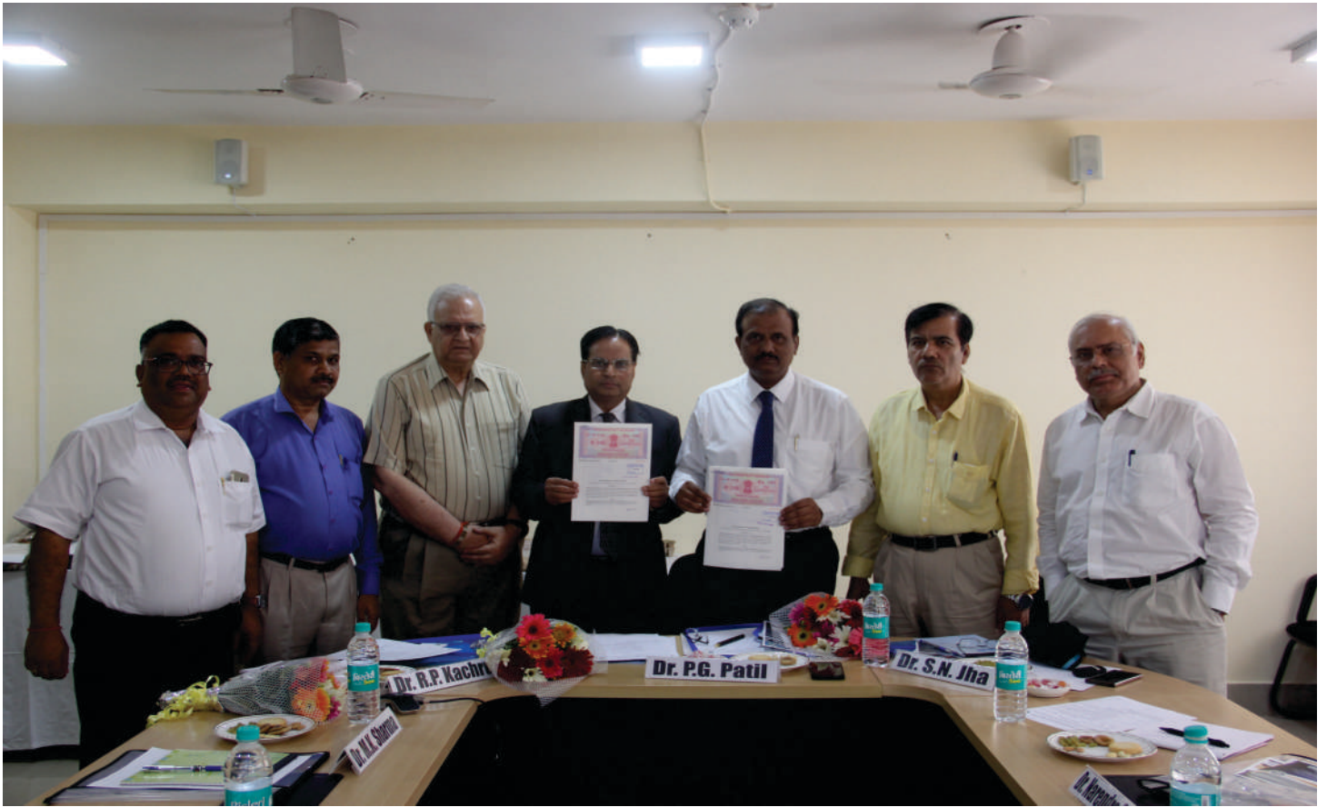
MoU signing with M/s Bajaj Steel Industries Limited, Nagpur

research on “Development of trash handling system for control of pink bollworm in cotton ginneries” on April 12, 2018.