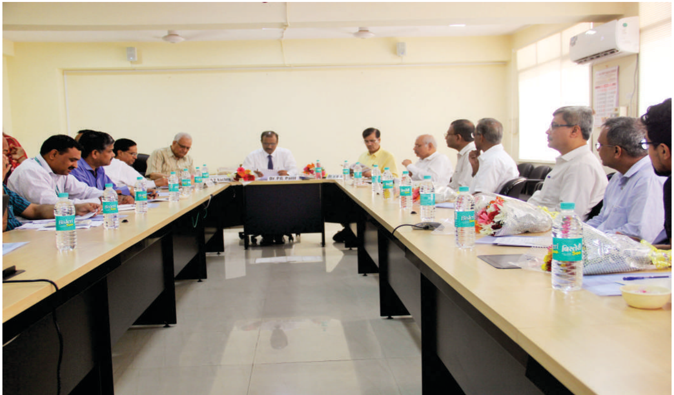
Second advisory meeting of ABI Centre at ICAR-CIRCOT

support received from the institute and their future plans.