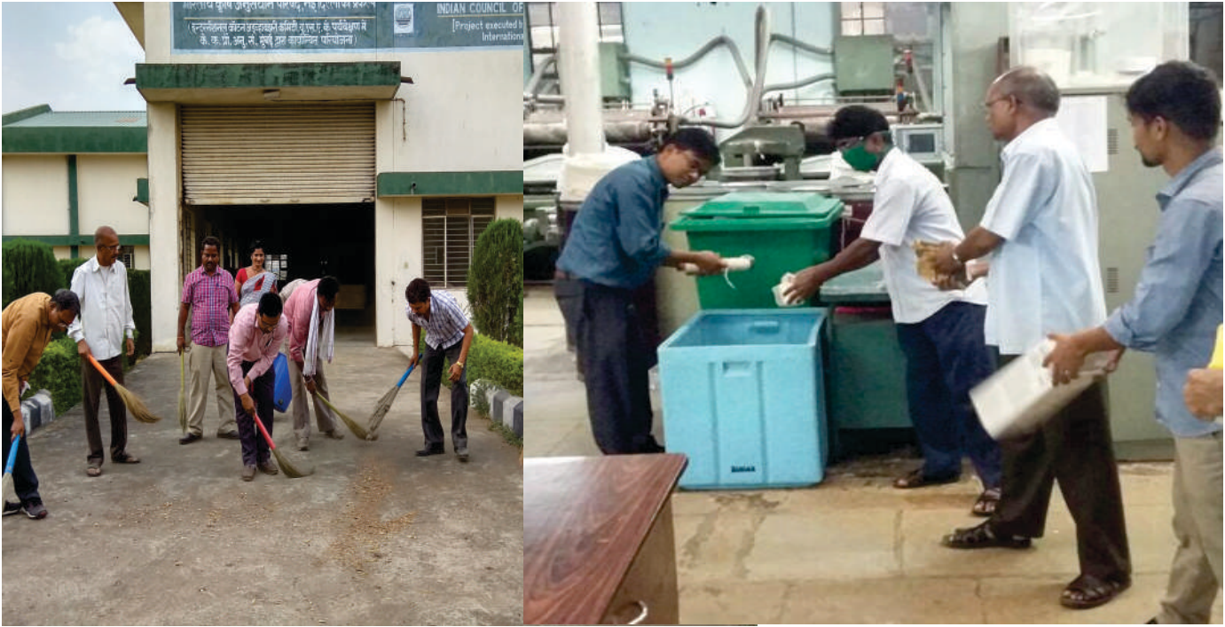
Cleanliness programme at GTC, Nagpur & MPD, ICAR-CIRCOT, Mumbai