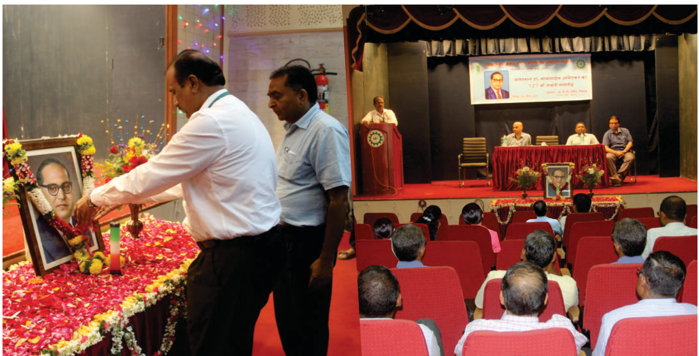
Dr. B. R. Ambedkar Jayanti Celebration at ICAR-CIRCOT