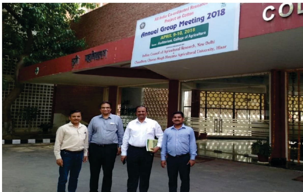
Annual Group Meeting of AICRP on Cotton at CCSHAU, Hisar

Identification Committee" meeting held at Chaudhary Charan Singh Haryana Agricultural University (CCSHAU), Hisar during April 09-10, 2018.