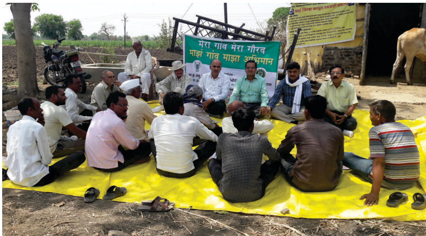
Kisan Gosthi organized at village Rehaki, of Wardha district

Yojana, Pradhan Mantri Krishi Sinchayee Yojana (PMKSY), Pradhan Mantri Ujjwala Yojana, etc.