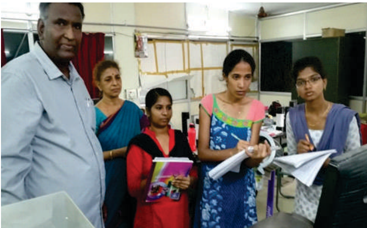
Students of Home Science College, ANGRAU visited CIRCOT's QE unit at Guntur