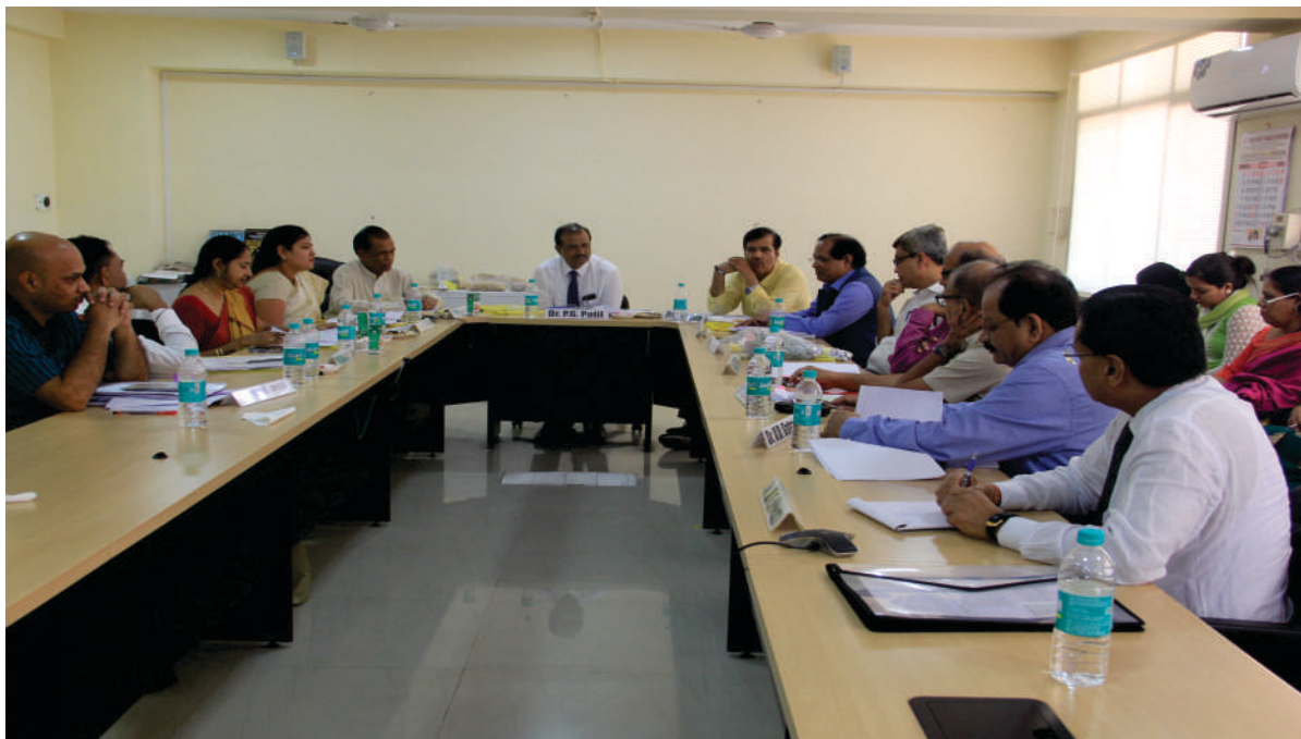
Joint meeting of QRT and IMC members at ICAR-CIRCOT