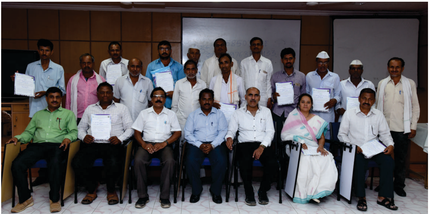
Training programme on “Increasing Farm Income through Increase in Production and Processing of Cotton at Village Level”

strategy for control of pink boll worm, biological inputs in cotton farming, pest and disease management techniques, cotton marketing, fibre quality parameters and by-products utilization. The training also covered practical sessions on pellets, compost and oyster mushroom production using cotton stalks and demonstration of Ginning, oil extraction and particle board preparation. Trainees were also taken for visits to ICAR-CCRI, Nagpur, M/s Neem Foundation, Gondkhairy, Tehsil- Kalmeshwar, Nagpur and M/s Ankur seeds Pvt. Ltd., NERI farms.