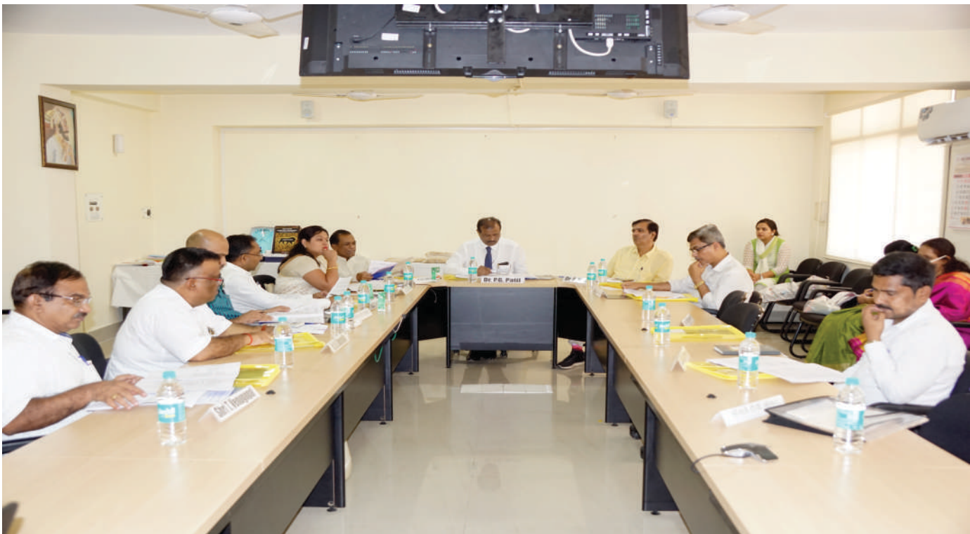
77 th IMC meeting being held at ICAR-CIRCOT

demand for additional fund for the year 2018-19, condemnation of old vehicles, approval of IMC for nomination of the Grievance Committee, approval of the IMC for Hospitals and report on the official implementation were discussed in the meeting.