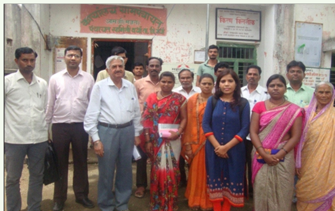
Experts team along with farmers at Gram Panchayat, Majra, Wardha