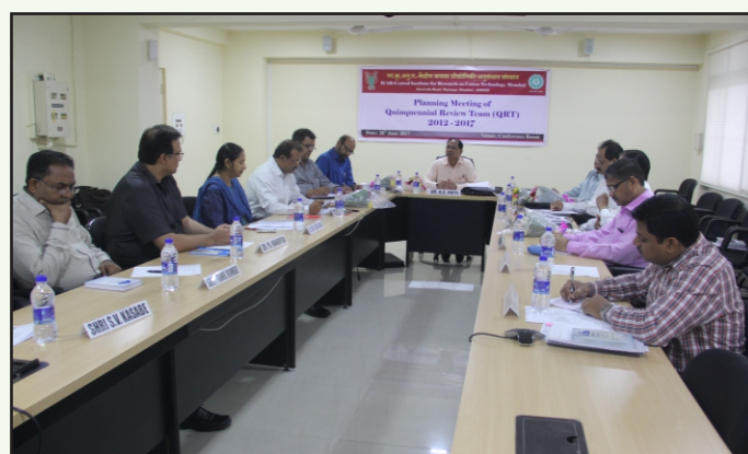
Planning meeting of the QRT in progress on June 28, 2017