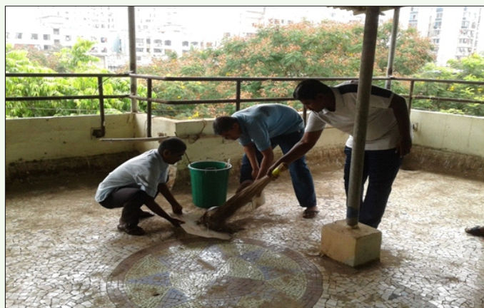
Cleaning the terrace of Param Staff Quarters, Ghatkopar under the Swachha Bharat Abhiyan

A cleanliness programme was conducted at Ghatkopar staff quarters on June 8, 2017 between 10 am to 1 pm. The terrace of Param quarters was cleaned by removing the waste pipes, unused wooden materials, other unwanted materials and handed over to the BMC staff for proper disposal. Thereafter cleaning was carried out at Karpasa staff quarters also, where the terrace was cleaned and unused material such as metal racks, rods, wooden materials etc. were arranged and kept properly. All the staff residing in the staff quarters along with the other institute staff members enthusiastically participated in the cleaning programme.