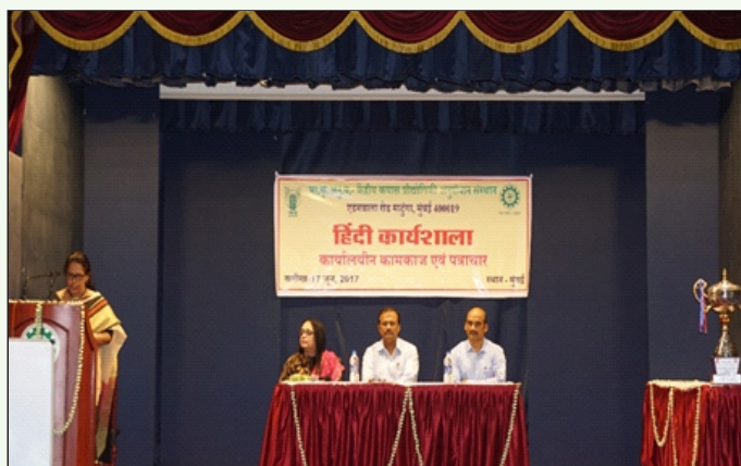
Hindi Workshop on Karyalayin Kamkaj Evam Patrachar on June 17, 2017