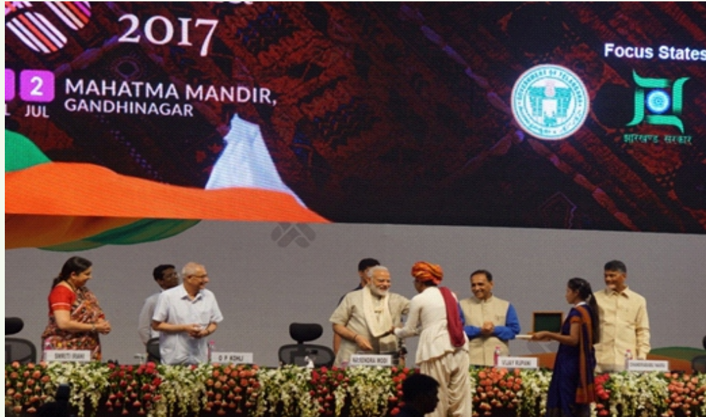
Hon'ble Prime Minister, Shri. Narendra Modi inaugurating “Textile India- 2017”

ICAR-CIRCOT participated in “Textile India-2017” mega event organized by Ministry of Textiles, Govt. of India at Gandhinagar, Gujarat from June 30, 2017 to July 2, 2017. The event was inaugurated by Shri. Narendra Modi, Hon'ble Prime Minister, Govt. of India on June 30, 2017.