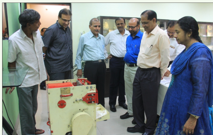
QRT members visiting various facilities at the institute