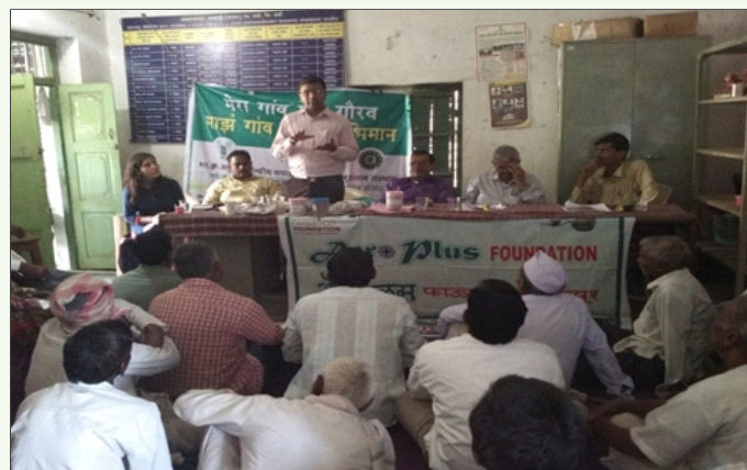
CIRCOT scientists interacting with the farmers at Majra Village, Wardha as part of the Mera Gaon Mera Gaurav program