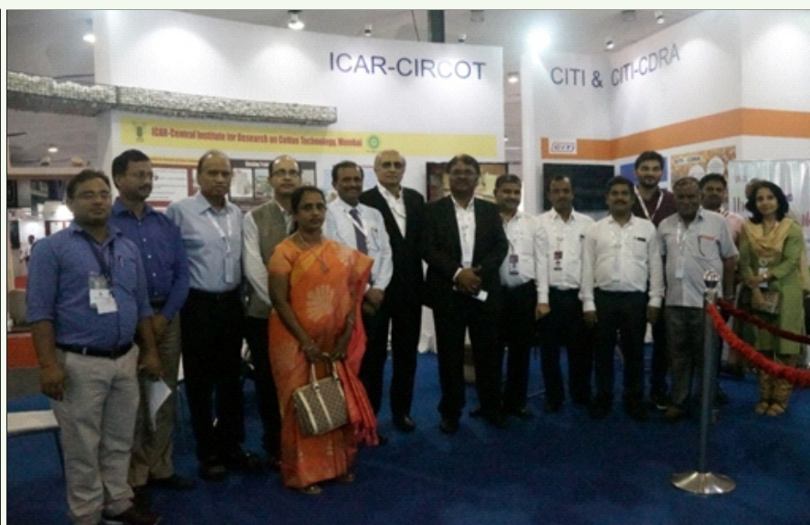
ICAR- CIRCOT team along with staff of CCI, CAI, Textile Committee and SIMA at Textile India- 2017