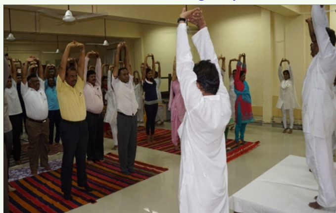
Staff members actively participating in the International Yoga Day celebrations