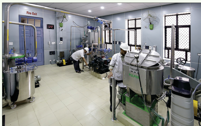
Refining unit for production of Nano Cellulose

Nano Fibrillated Cellulose (NFC) is obtained from wood pulp by means of different mechanical production processes like refining, high pressure homogenization and friction grinding. Refining, being the simplest and well-established process, is widely adopted for the commercial production of NFC, but the major problem is heat generation during the refining process that leads to charring and colour change (white to grey) of the resultant product. To overcome this problem, low-temperature refining was used for production of NFC from cotton linters. Initially, cotton linters were kier boiled to remove lignin and wax, followed by bleaching process. Then, the material was beaten in a Hollander beater for 4h followed by refining in a tri-disc refiner attached with material recirculating system. To control the temperature rise during the processing, the material was cooled during the recirculation process using cold water or by jacketing with ice. The resultant product (NFC) was not charred and was in the size range of 150-200 nm when refined for 1-2 h. An XRD analysis confirmed that the crystallinity was maintained at 83% and was not affected by the high-intensive refining process.