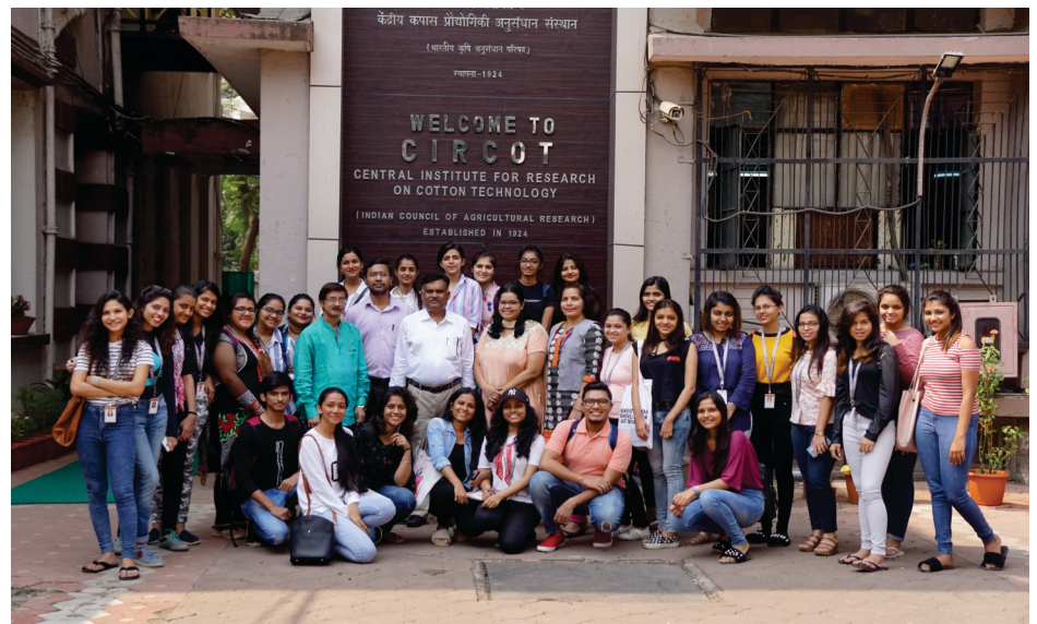
Students of Mithibai College, Vile Parle, Mumbai at ICAR- CIRCOT