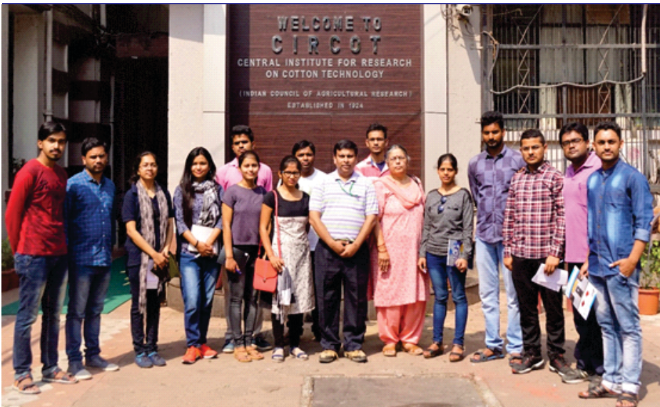
Students of IARI, New Delhi at ICAR-CIRCOT