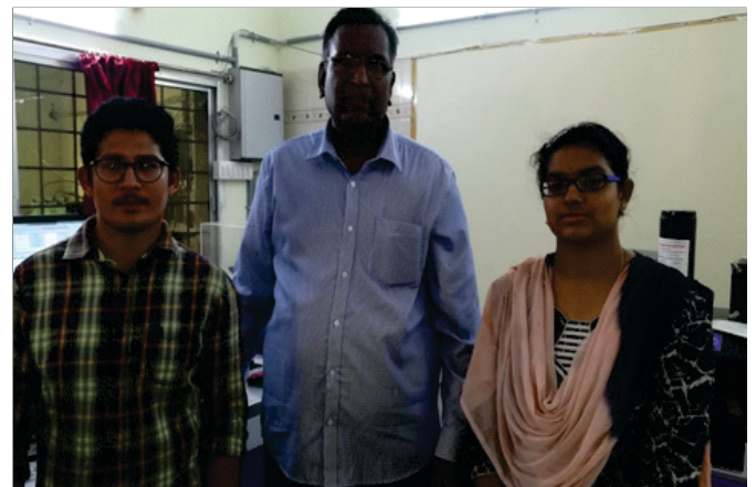
Students of Acharya NG Ranga Agricultural University, visited CIRCOT's QE unit at Guntur