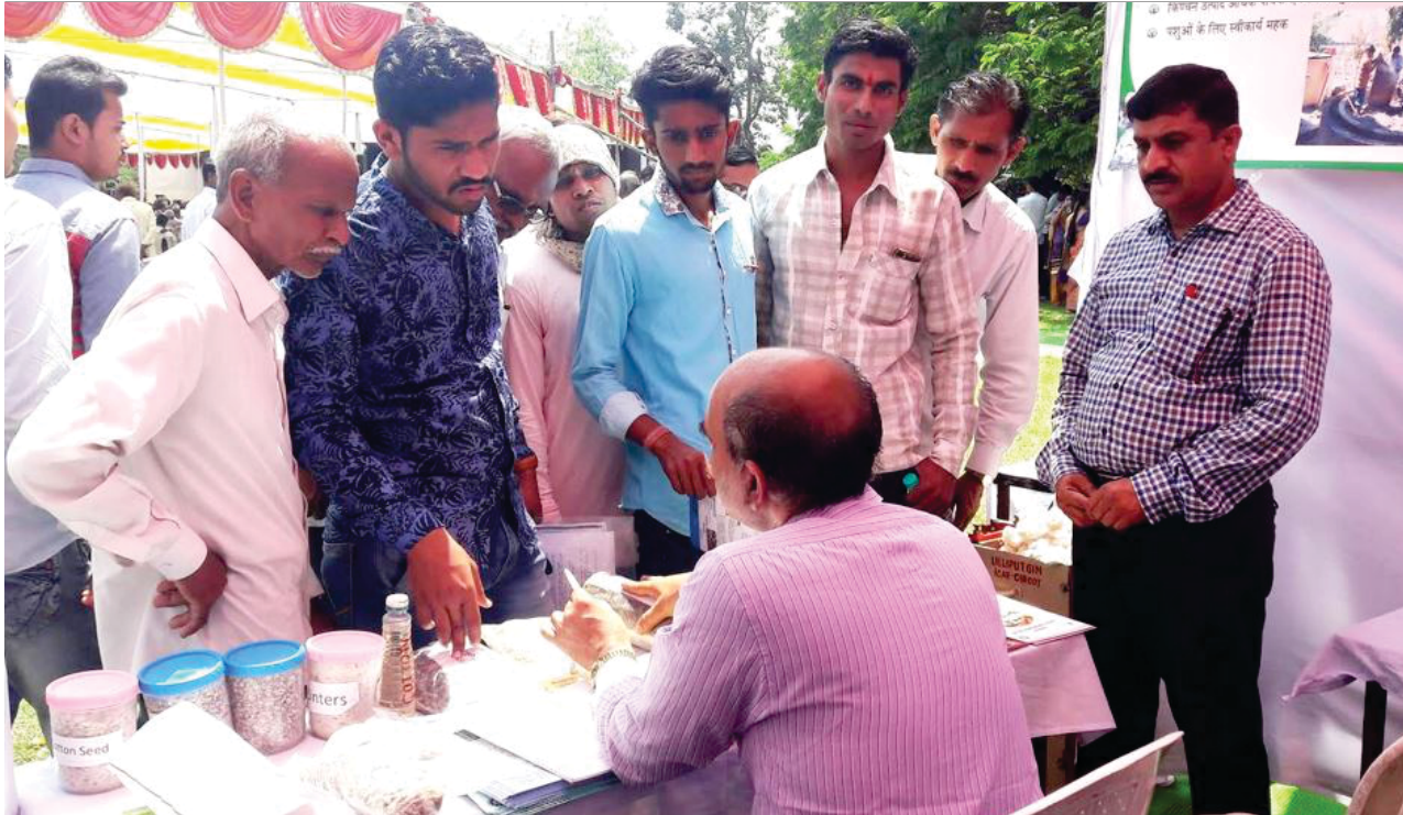
ICAR-CIRCOT's stall at Kisan Mela, Nagpur