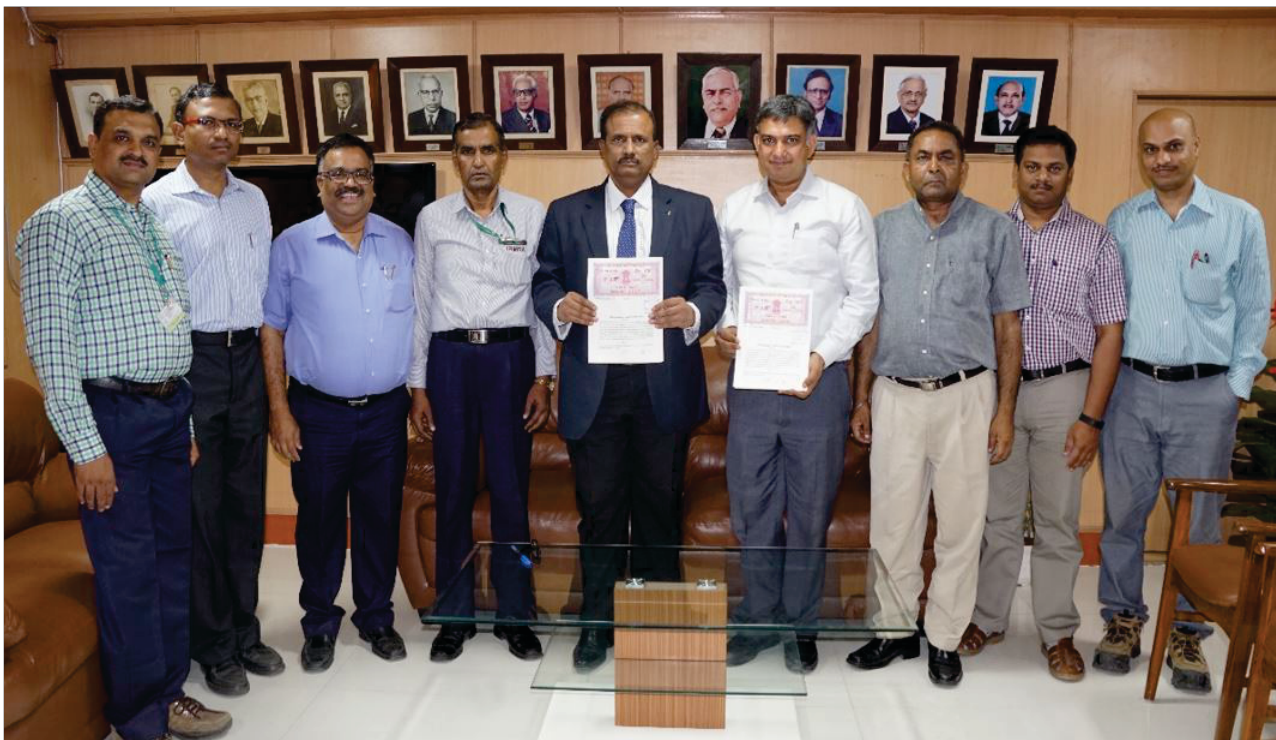
MoU signing with M/s Forech Mining & Construction International LLP, New Delhi