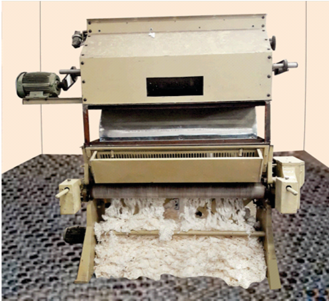
Spike cylinder single locking cotton feeder was developed at ICAR-CIRCOT

energy. Optimum moisture level of 7.38 & 7.15 % and spike cylinder speed of 307 & 297 RPM with desirability of 0.9185 & 0.8923 was arrived using multiple regression analysis for long and medium staple cotton respectively. Use of single locking cotton feeder for long and medium staple cotton resulted in 22 & 25 % increase in ginning output and 12 & 13.5 % reduction in specific energy requirement respectively as compared to conventional system comprising of auto feeder. Single locking feeder showed significant improvement in colour grade of cotton. Other HVI and AFIS fibre quality parameters remained unaffected. With these advantages, single locking feeder would be highly useful for cotton ginneries.