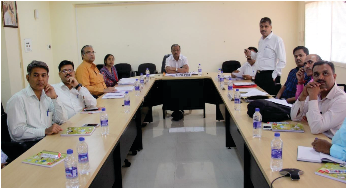
118 th IRC meeting at ICAR-CIRCOT

that the scientists should strengthen the research consultancy and bring in Industry partners to collaborate in their research projects for the ease of technology commercialization. The achievement of the Institute in revenue generation (> Rs. 1.5 crore) and the efforts of GTC, Nagpur for its contributions (> Rs. 50 Lakhs) were acknowledged in the meeting.