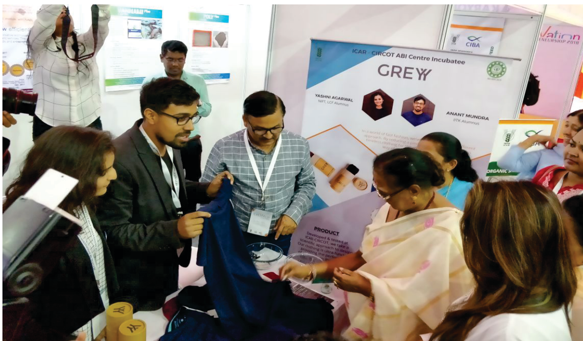
Mrs. Savita Kovind, Hon'ble First Lady of India visiting Incubatee stall