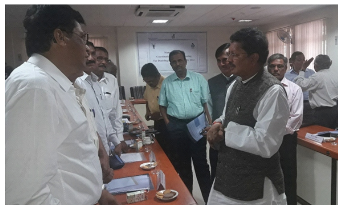
Shri. Deepak Kesarkar, Minister of State for Home (Rural), Finance and Planning, Govt of Maharashtra during state level coordination committee meeting held at NRC grapes on April 27, 2017.