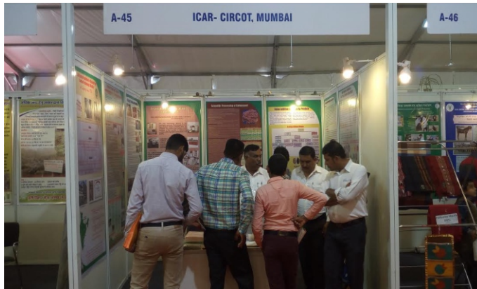
Students, Entrepreneurs and Businessmen at ICAR-CIRCOT stall at New Delhi