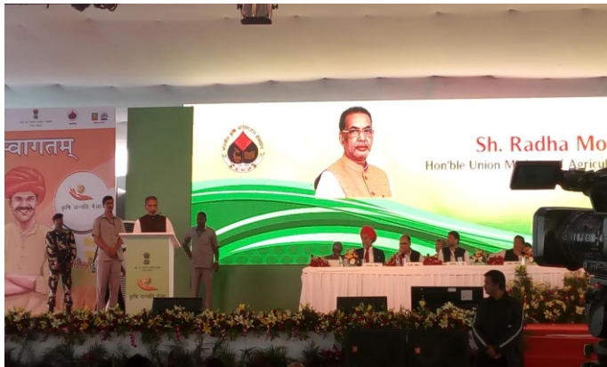
Shri. Radha Mohan Singh, Hon'ble Union Minister of Agriculture and Farmer's Welfare, GOI, giving inaugural address in Krishi Unnati Mela