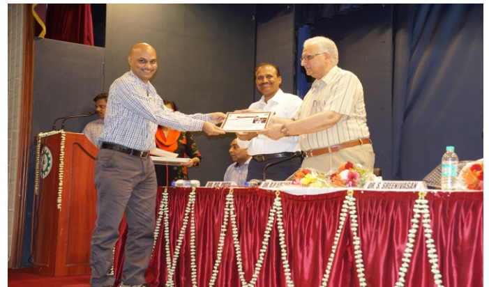
Cashless ICAR Institute Award Felicitation