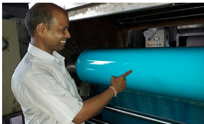
Industrial scale trial at M/S Ginni Silk Mills, Boisar