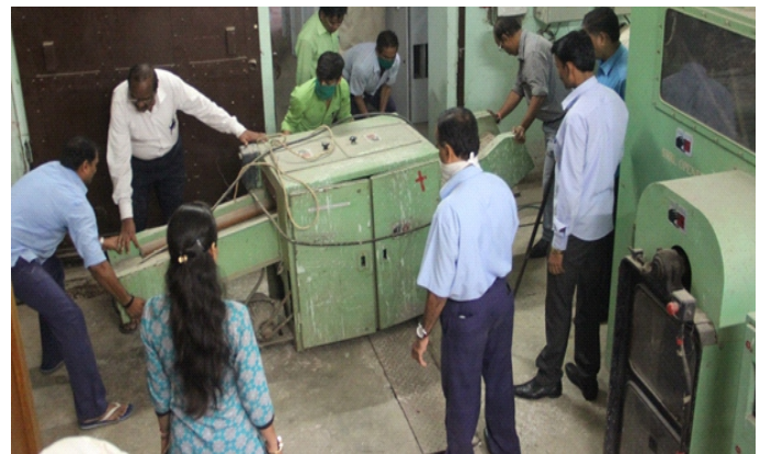
Cleaning and arrangement of machineries in MPD under Swachh Bharat Abhiyan on April 26, 2017

Another cleaning programme was organized at Mechanical Processing Division (MPD) in the institute on April 26, 2017. The blow room area was cleaned by removing the waste cotton and some machineries lying near blow room were relocated. All the staff members of MPD enthusiastically participated in the cleaning programme.