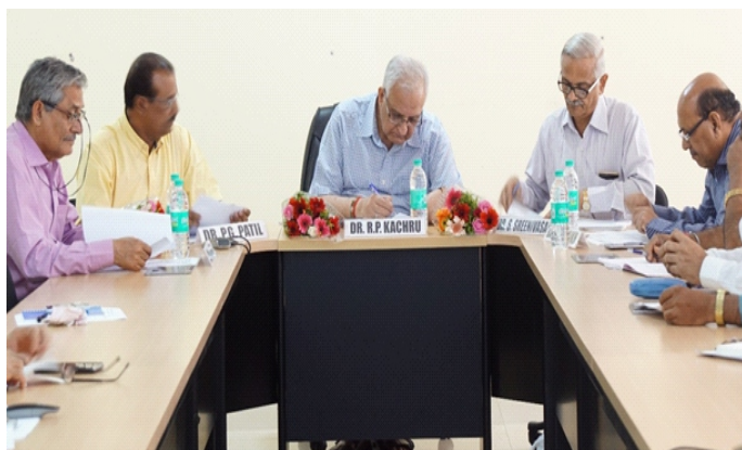
Members of pre-proposal screening committee during the meeting held on April 22, 2017