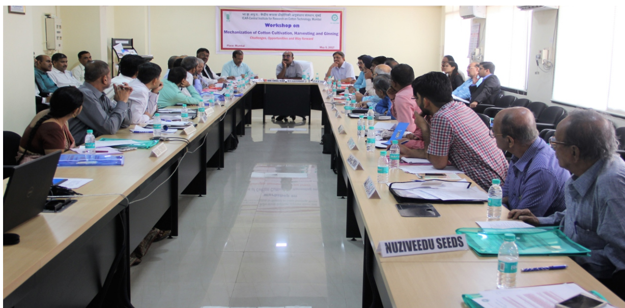
Deliberation on “Mechanization of Cotton Cultivation, Harvesting and Ginning: Challenges, Opportunities and Way Forward” with the stakeholders