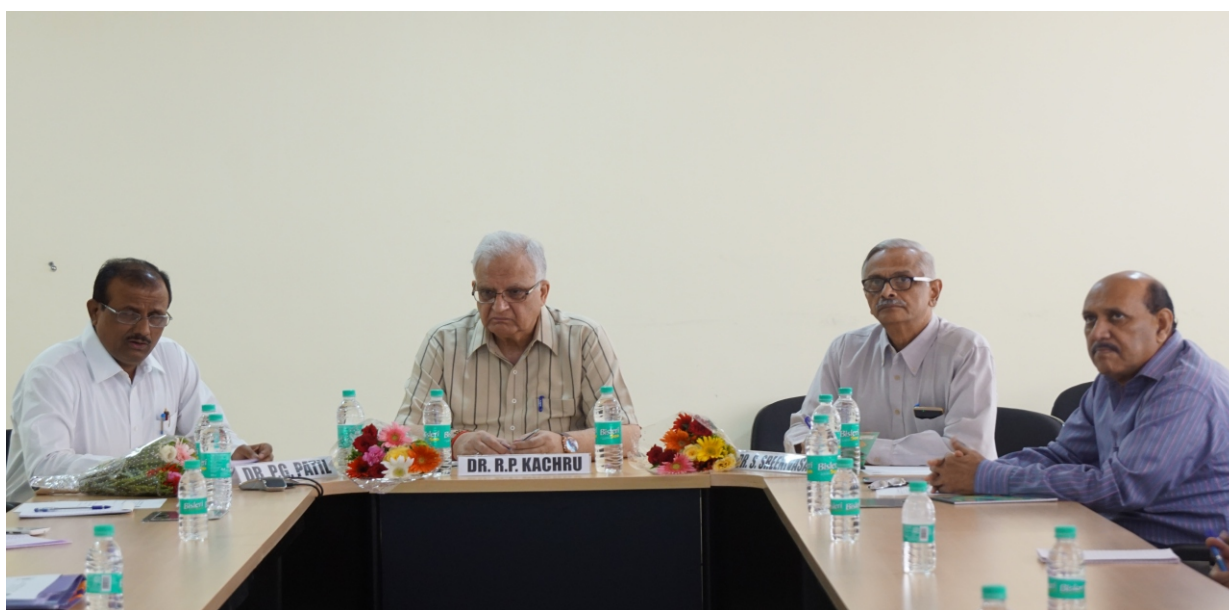
Members of advisory committee meeting in discussion on April 22, 2017