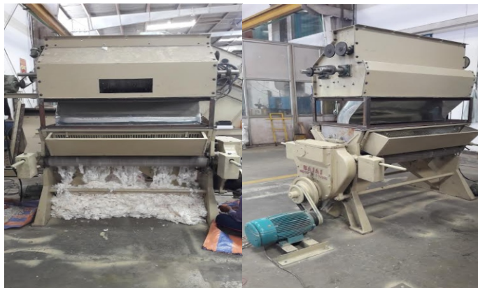
Single locking cotton feeder with DR gin

Cotton feeding mechanism to DR gin significantly affects ginning efficiency. Therefore to improve the feeding, an automatic single locking cotton feeder which regulates feed rate and ensures single locking of cotton & feed continuous batt of cotton at the ginning points across the knife edges of DR gin was designed. It was designed with three different mechanisms viz 1) saw band cylinders with twin regulator and apron 2) spike cylinders and feed roller 3) combination of both. First mechanism consists of twin regulator assembly with sensor controlled regulated feeding, saw band cylinder assembly for single locking of seed cotton and apron for uniform feeding of single locules at ginning point. Second mechanism consists of a pair of feed roller, pair of spiked cylinders and grid bar housed in a hopper, chute for cotton distribution on either side of DR gin. Third mechanism is a combination of the first and second mechanisms which comprises of feed roller, spike cylinders with saw band cylinders and apron, power transmission and main frame assembly. Prototypes of single locking cotton feeder with three designs have been developed and is under testing.