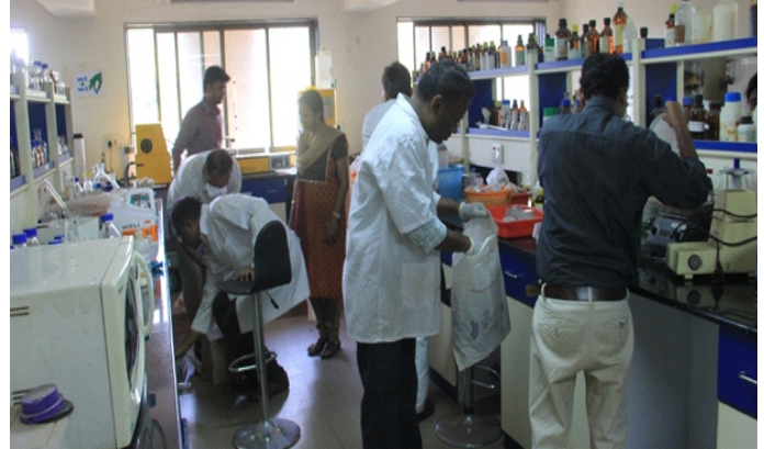
Cleaning and arrangement of chemical bottles, feed stock and consortia in CBPD under Swachh Bharat Abhiyaan on April 13, 2017

The unwanted materials like empty chemical bottles, unused and broken glass wears were taken out and stored properly for further disposal. All the staff members of CBPD and research students participated actively and enthusiastically in this cleaning programme.