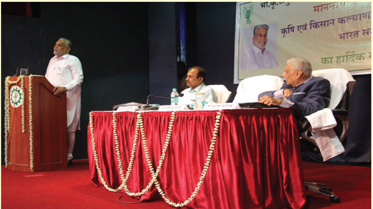
Shri Parshottam Rupala, Hon'ble Minister of State for Agriculture & Farmers Welfare and Panchayati Raj addressing ICAR-CIRCOT staff