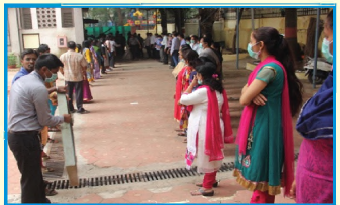
Staff removing old discarded items during cleanliness programme (Oct. 17, 2016)