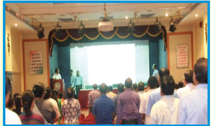
Director CIRCOT administering cleanliness oath on 17 th October, 2016 during Swachhata Pakhwara.

The Swachhata Pakhwada was also observed at CIRCOT regional stations Coimbatore, Sirsa and GTC, Nagpur during 16 - 31 October by conducting cleanliness drives at respective centres. In total 14 cleanliness drives, 2 workshops were arranged and three villages were covered.