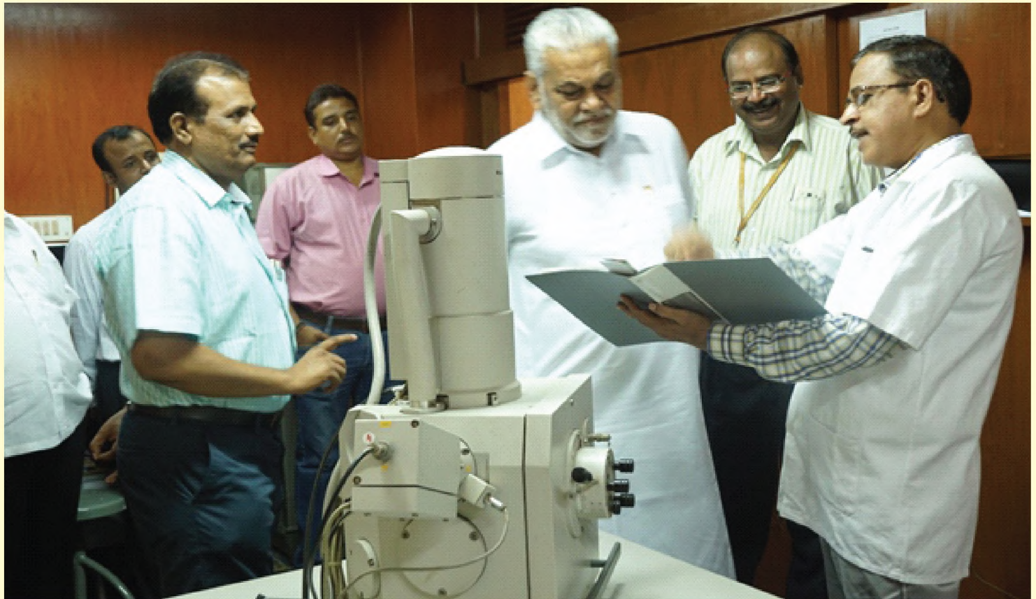
Hon'ble Minister of State for Agriculture & Farmers Welfare and Panchayati Raj Shri Parshottam Rupala at the Scanning Electron Microscopy Lab