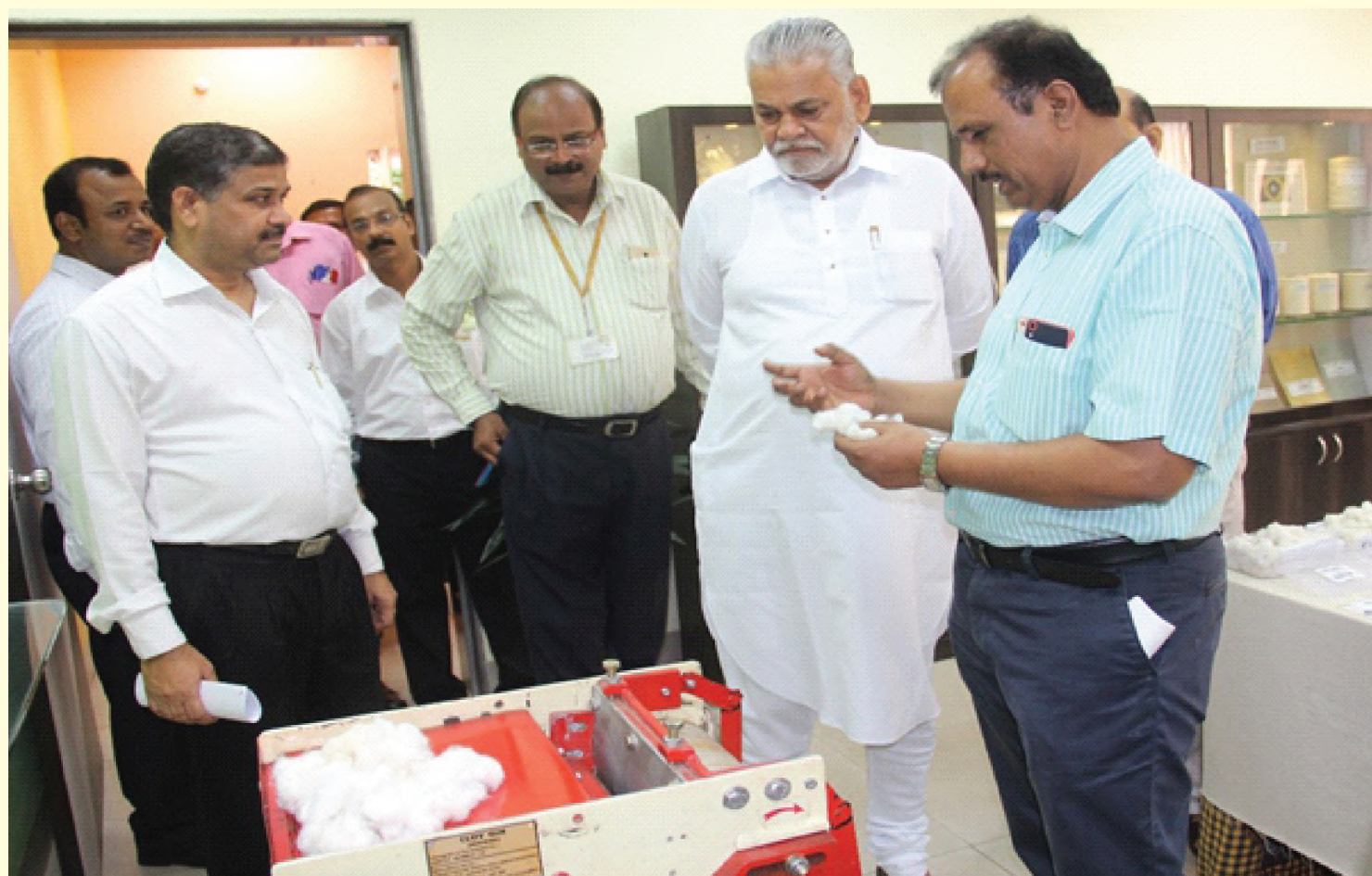
Hon'ble Minister of State for Agriculture & Farmers Welfare and Panchayati Raj Shri Parshottam Rupala at the CIRCOT exhibition room