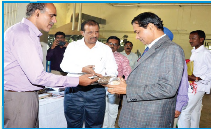
Demonstration of cotton stalk briquettes and pellets to the DG, ICAR at GTC, Nagpur