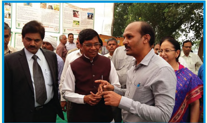
Shri Sudarshan Bhagat, Hon'ble Minister of State for Agriculture and Farmers Welfare being briefed about the products made by CIRCOT from cotton waste