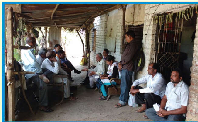
Awareness programme organized in Morchapur village on October 22, 2016