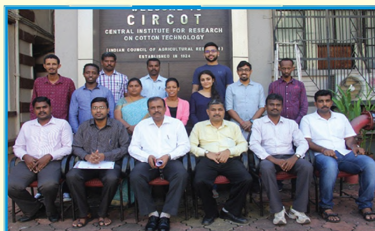
Group Photo of Training Programme on “Fibre & Yarn Quality Management in Spinning”