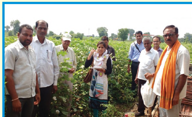
On-field interaction with farmers of Anji village on October 26, 2016