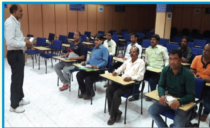
A group of 10 farmers from Betul District in Madhya Pradesh visited GTC, Nagpur