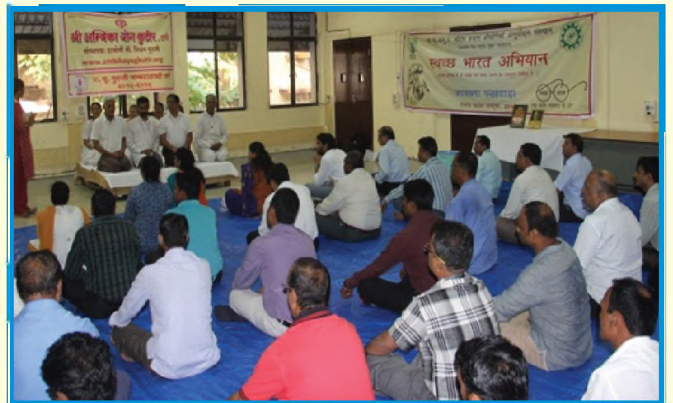
ICAR-CIRCOT staff practicing Yoga during Yoga Workshop (Oct. 29, 2016)