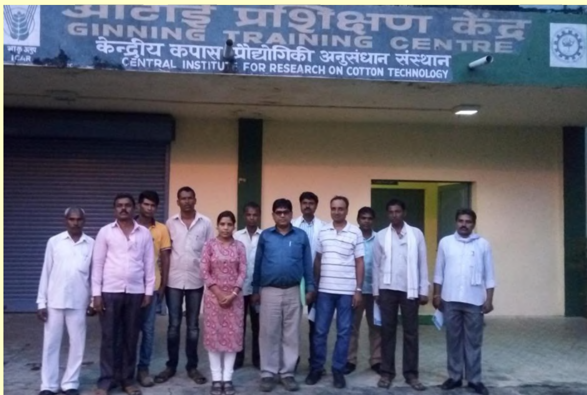
Farmers from Madhya Pradesh at GTC, Nagpur on August 29, 2016

demonstration on the technologies for mushroom production, composting of cotton stalks for additional remuneration, cotton stalk particle board and pellet making facilities for the benefit of farmers.