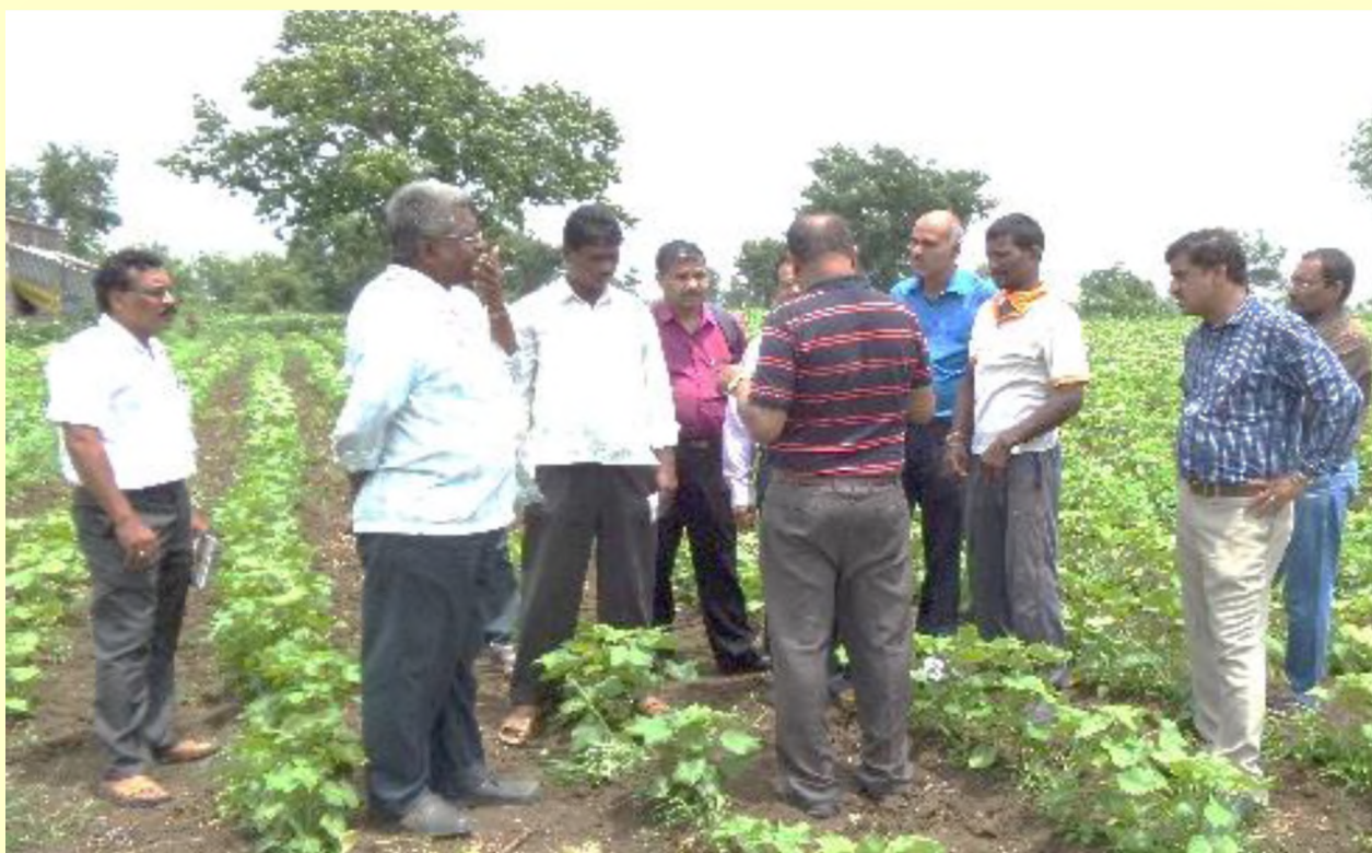
Field interaction with progressive farmers at Sawali village on August 19, 2016.