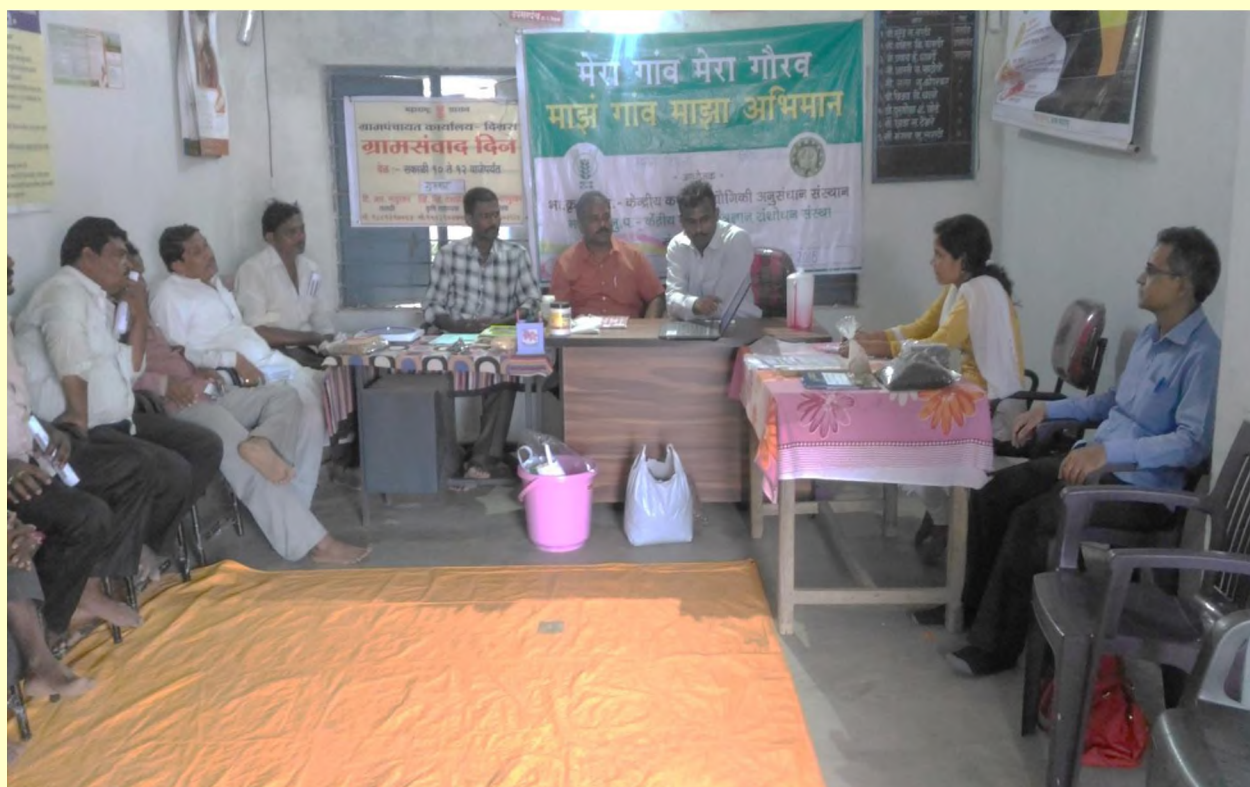
CIRCOT scientists giving demonstrations to farmers during Mera Gaon Mera Gaurav programme on August 4, 2016