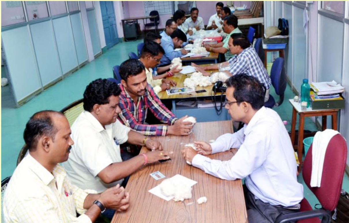
Trainees while doing hands-on practical training on manual cotton stapling at GTC, Nagpur