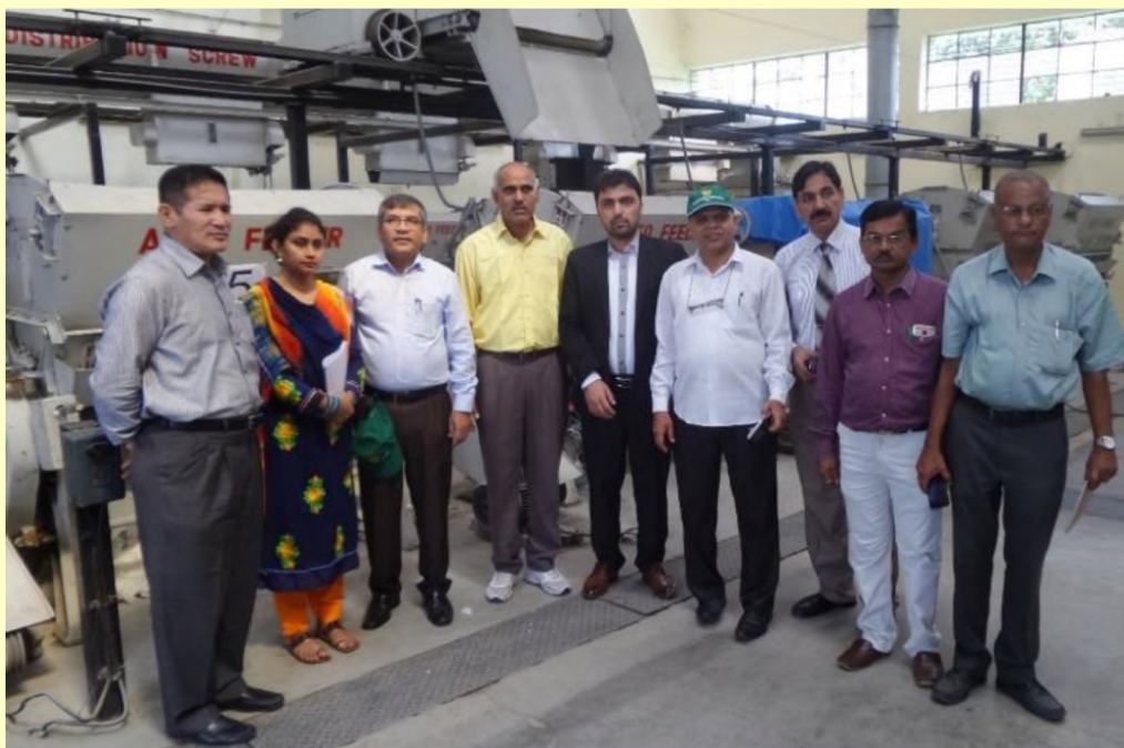
SAARC delegates from Bangladesh, Nepal, Pakistan, Afghanistan and Bhutan at GTC, Nagpur.

Delegates also interacted with GTC scientists and explored the possibilities of undertaking coordinated research work for mutual benefits of farmers and stakeholders.