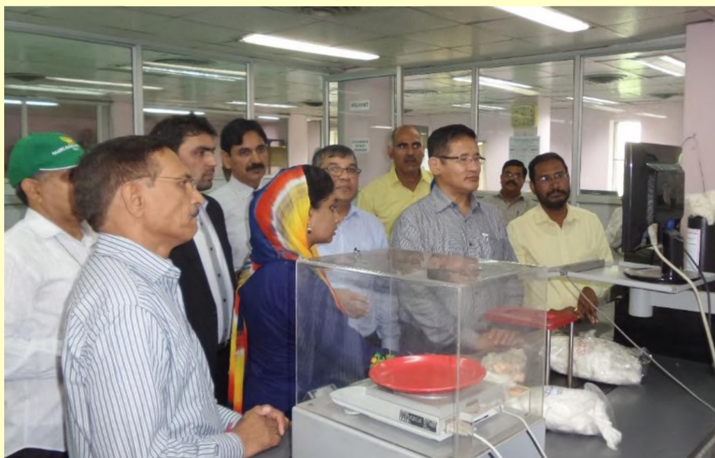
SAARC delegates in fibre testing laboratory at GTC, Nagpur.