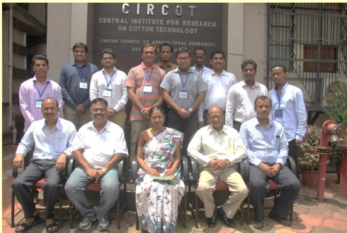
Group Photo of trainees who attended training on "Value Addition to Cottonseed" held at CIRCOT, Mumbai.

products and demonstrations on various value addition technologies were also conducted.