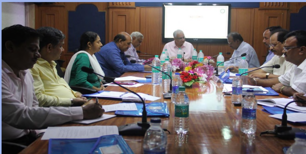
Deliberations during Advisory sub-committee meeting of Agri Business Incubation (ABI) Centre

Scientist & member of ICAR-CIRCOT-ABI Management Team on the progress of activities. The management support being provided to the three admitted entrepreneurs and their future course of action was also discussed in detail.