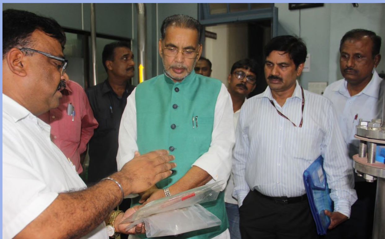
Hon'ble Union Minister of Agriculture and Farmers Welfare, Shri. Radha Mohan Singh in Nanocellulose Pilot Plant