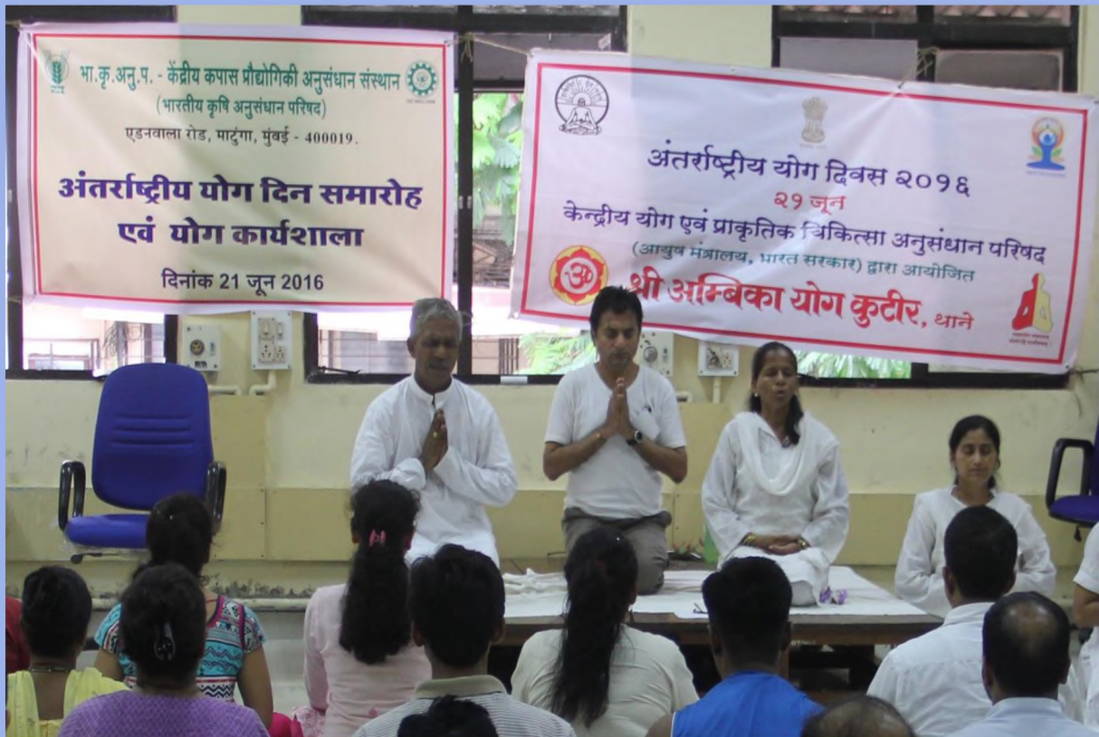
International Yoga Day and Yoga Workshop at ICAR-CIRCOT on 21 st June, 2016