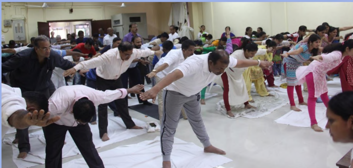
ICAR-CIRCOT staff performing yoga on International Yoga Day