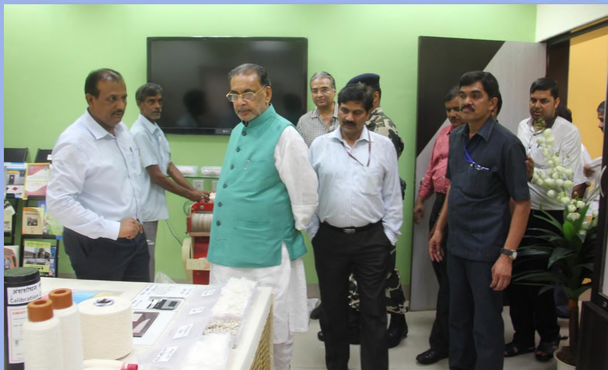
Hon'ble Union Minister of Agriculture and Farmers Welfare, Shri. Radha Mohan Singh in exhibition Hall of Institute