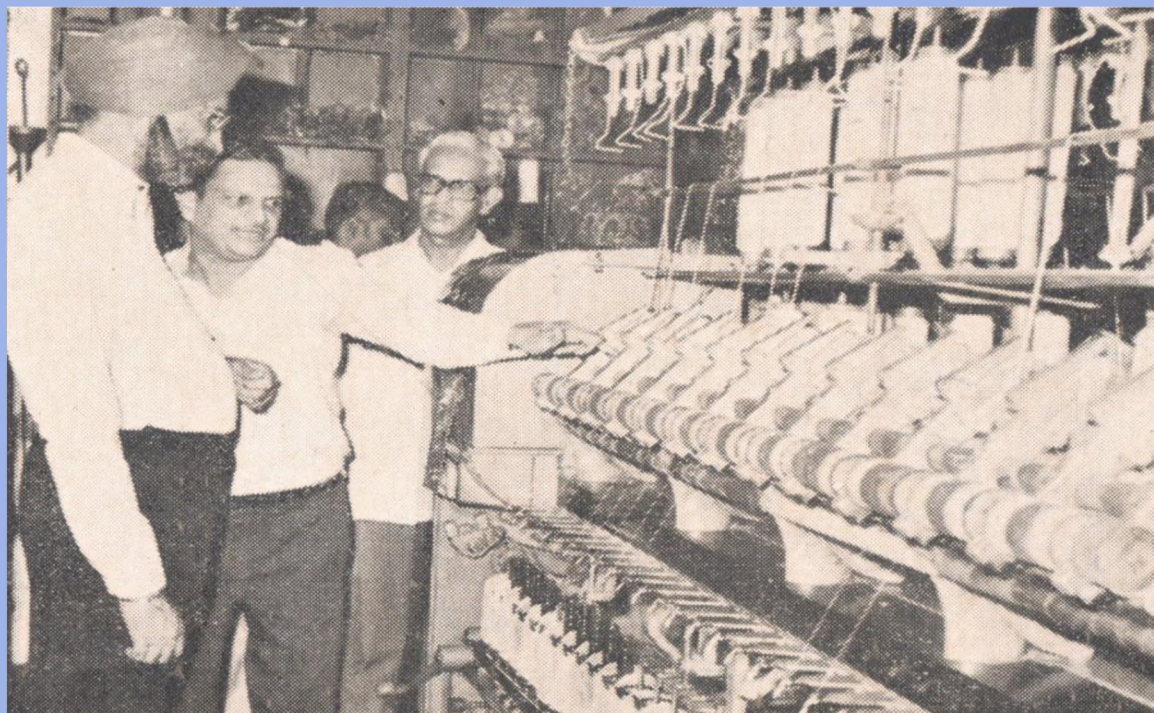
Shri S. S. Barnala, Union Minister for Agriculture and Irrigation, Govt. of India visited ICAR-CIRCOT on December 27, 1977.