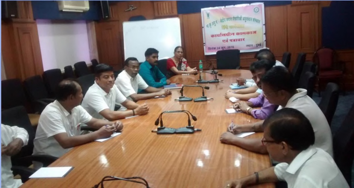
Skilled supporting staff of CIRCOT participating in Hindi Workshop