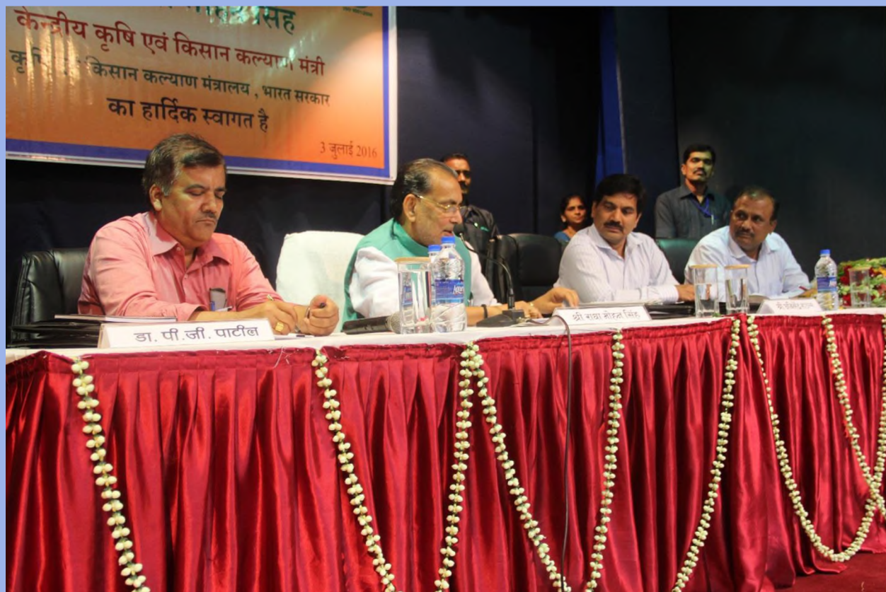
Hon'ble Union Minister of Agriculture and Farmers Welfare, Shri. Radha Mohan Singh while addressing ICAR-CIRCOT staff