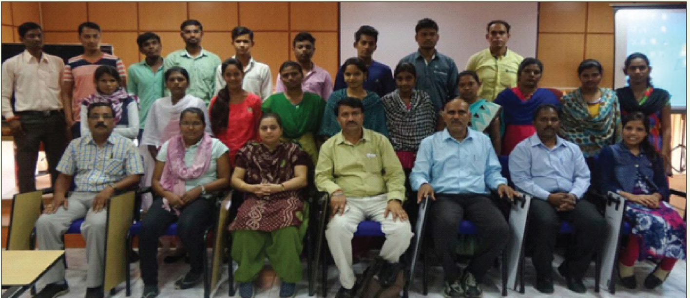
Group photo of the awareness programme on “Cotton stalk processing and utilization” at GTC, Nagpur on March 30, 2017

Under the skill development programme for organic growers, a one-day awareness program on “Cotton stalk processing and utilization” was conducted on March 30, 2017 at GTC Nagpur for a group of seventeen trainees from the Regional Centre of Organic Farming. The trainees were imparted knowledge about collection and logistics of cotton stalks for energy purpose, bio-enriched compost and oyster mushroom production and role of bio-fertilizers in organic farming. Highlighting the importance of bio-enriched compost prepared using ICAR-CIRCOT technology in organic farming of cotton and other crops, live demonstrations were conducted on steps involved in preparation of the bio-enriched compost and oyster mushroom cultivation.