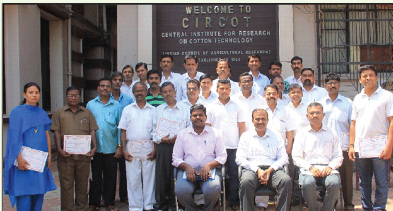
Group photo: Participants of the training programme on “Work-Opportunities for Development” organized for “Skilled Support Staff”