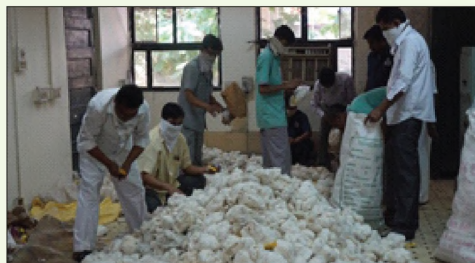
Cleaning and storing of cleaned cotton samples in QEID test house under Swachh Bharat Abhiyaan on March 27, 2017