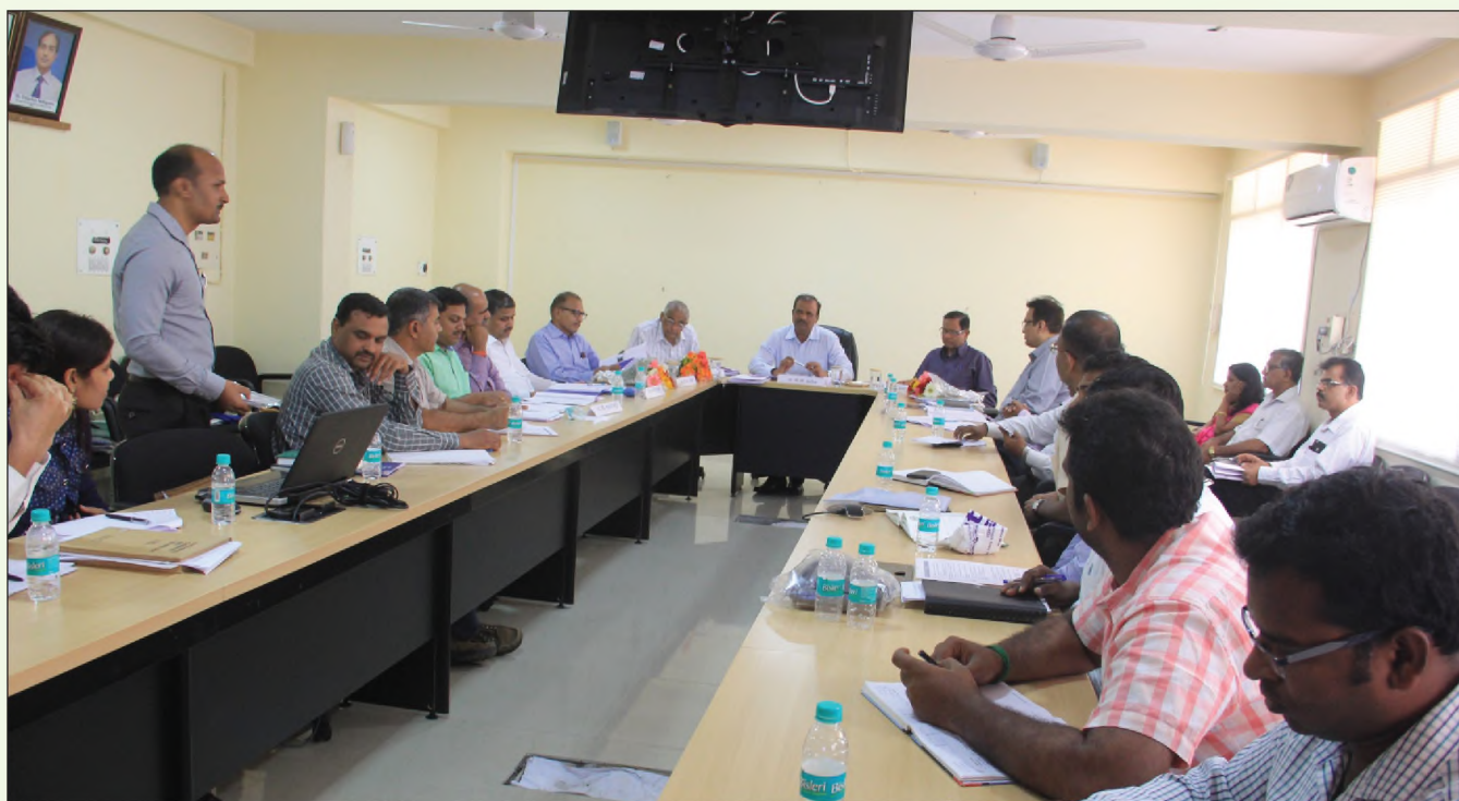
The 117 th IRC meeting in progress on March 20, 2017