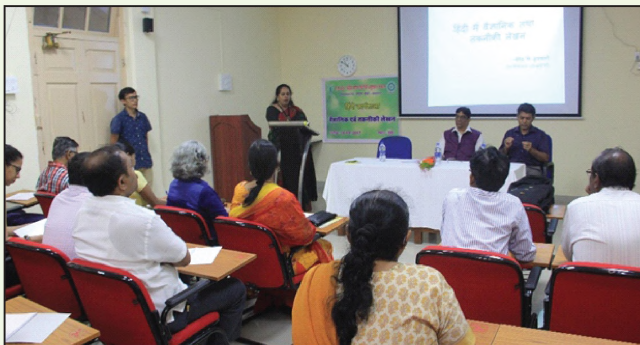
Training-cum-workshop on “Scientific and Technical Writing” in Hindi