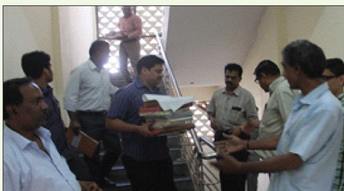
Staff members of TTD division clearing old files during Swachh Bharat Abhiyaan held on March 8, 2017

All the Institute staff members participate enthusiastically in the cleaning activities under the programme. A cleanliness programme was carried out in the Transfer of Technology Division on March 8, 2017 when old files, booklets and materials lying unused were sorted out and removed. Quality Evaluation and Improvement Division (QEID) also conducted cleaning activity under swachh bharat abhiyan on March 27, 2017 and removed the remaining cotton from the test samples bags kept in the store room, stacked in gunny bags which could be disposed off through auctioning.