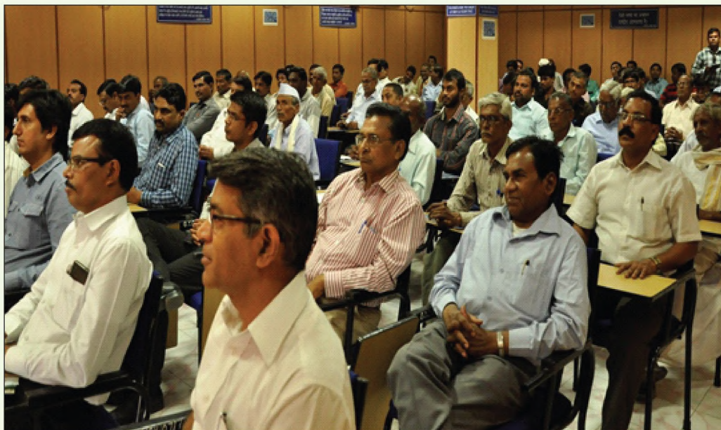
Participants for the technical session on cotton processing and by-product utilization