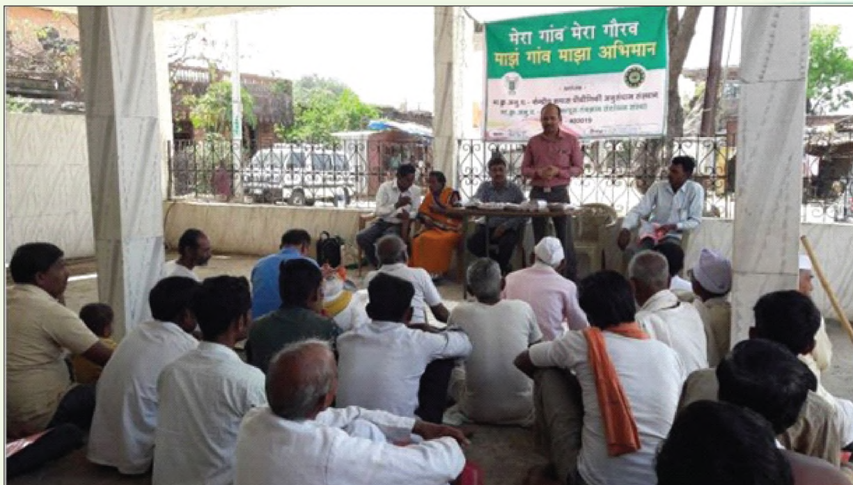
The farmers of Belghat village of Wardha district during the Mera Gaon Mera Gaurav programme on March 9, 2017