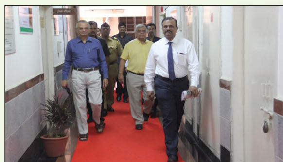
Padma Vibhushan Dr. Anil Kakodkar at ICAR-CIRCOT, Mumbai