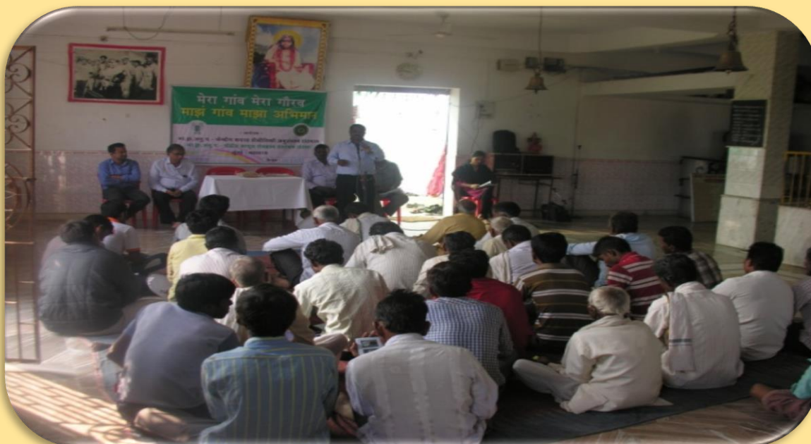
Participation of farmers at bio-enriched compost from cotton stalks at Palasgaon village