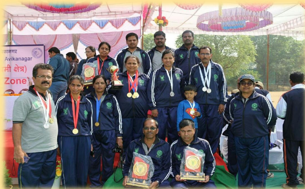
Group photo: Medal winners of ICAR West Zone Sports Tournament 2015