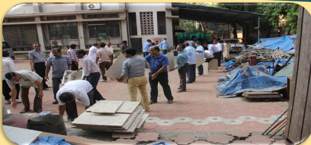
ICAR-CIRCOT staff at cleaning activities on 28 th November, 2015