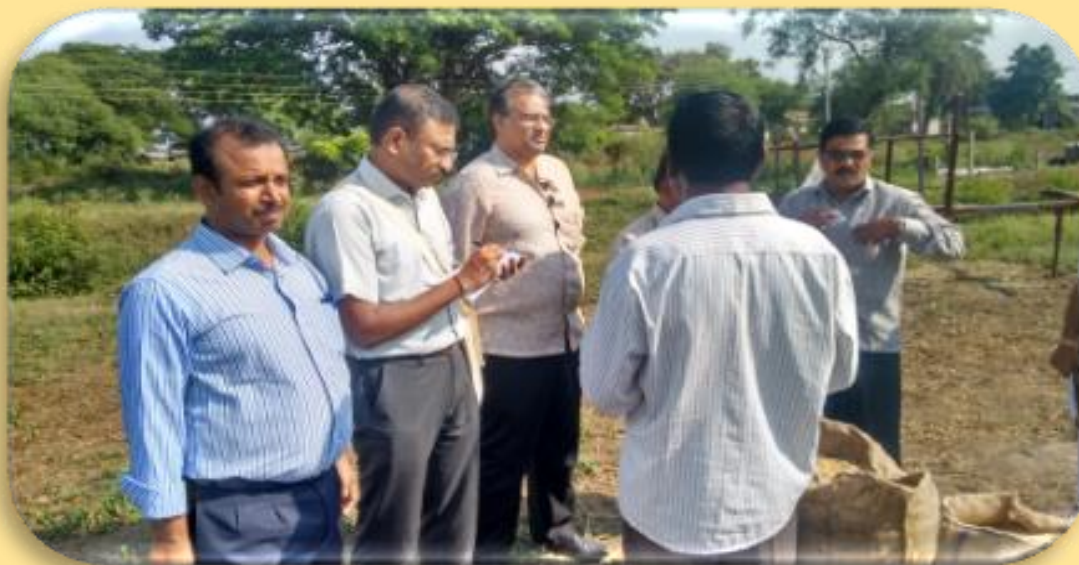
ICAR-CIRCOT scientists during visit to Isapur village, Wardha