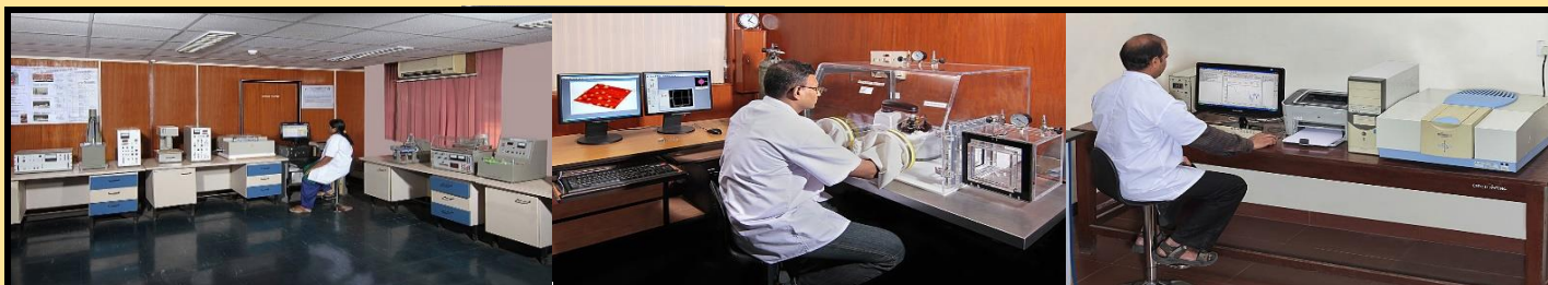
KAWABATA EVALUATION SYSTEM