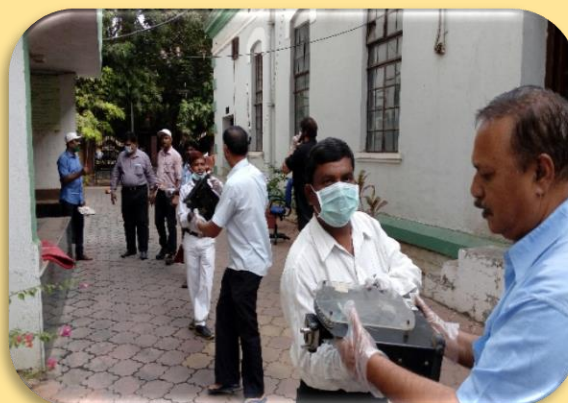
ICAR-CIRCOT staff at cleaning activities on 21 st November, 2015

Old scrap, unserviceable items and damaged papers were removed from the Institute building on 21 st , November 2015 and November 28 th , 2015. The staff of the Institute carried out cleaning activities.