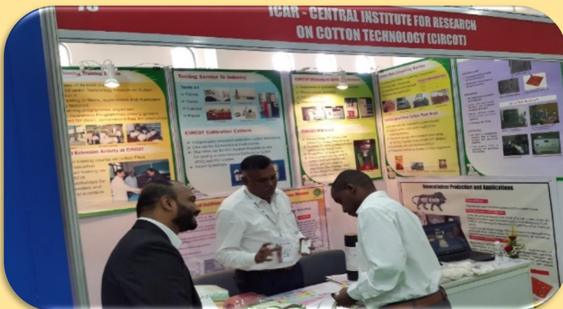
Foreign delegates visited ICAR-CIRCOT stall