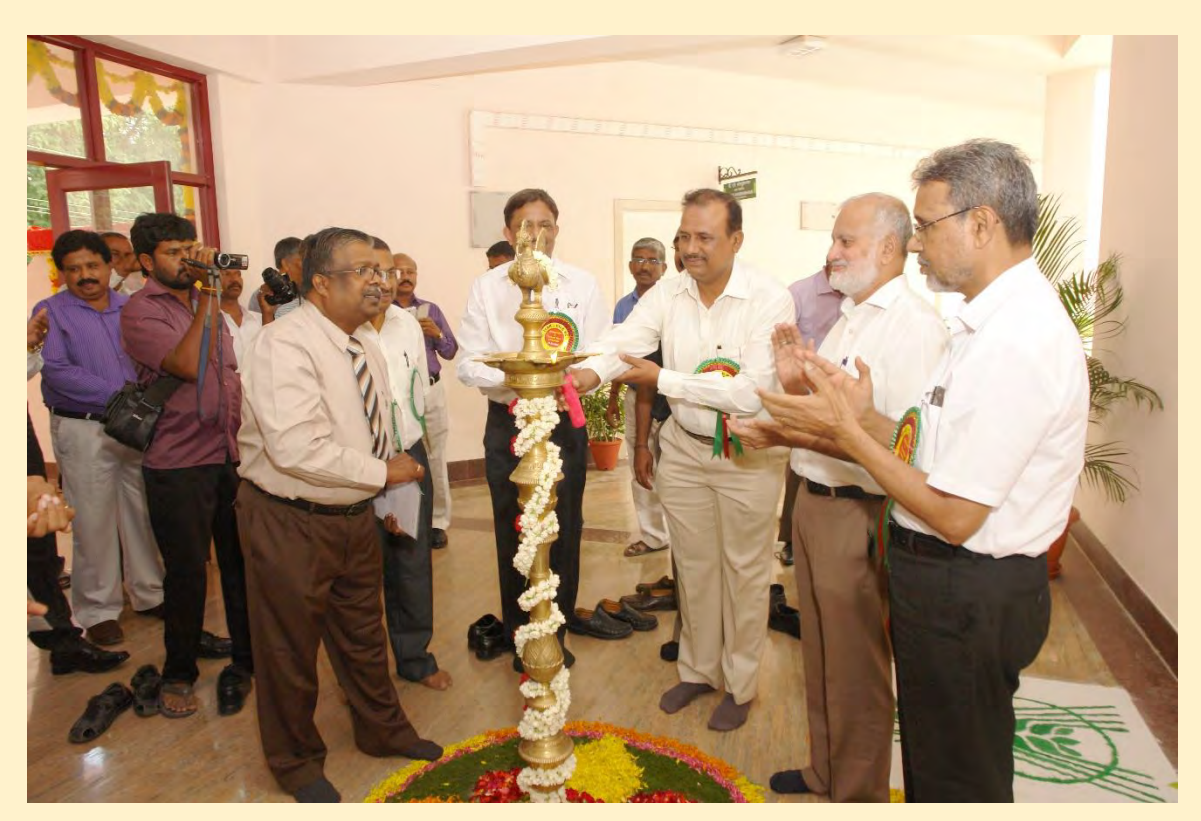
Lighting the lamp during the inaugural function of ICAR-CIAE Regional Station, Coimbatore