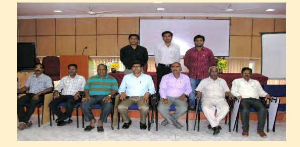
Group Photo: Training program on Double Roller Ginning Technology and Cotton Quality Evaluation (Batch I)

delivered by outside experts. The trainees were also demonstrated the functioning of particle board and scientific cottonseed processing units. They were also taken for industrial visit to M/s Bajaj Steel Industry Ltd, Nagpur.