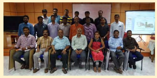
Group Photo: Training program on Double Roller Ginning Technology and Cotton Quality Evaluation (Batch II)