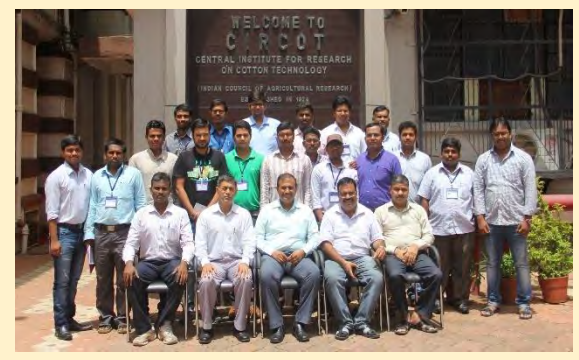
Group Photo: Quality Evaluation of Cotton (Batch II, August 17-21th, 2015)