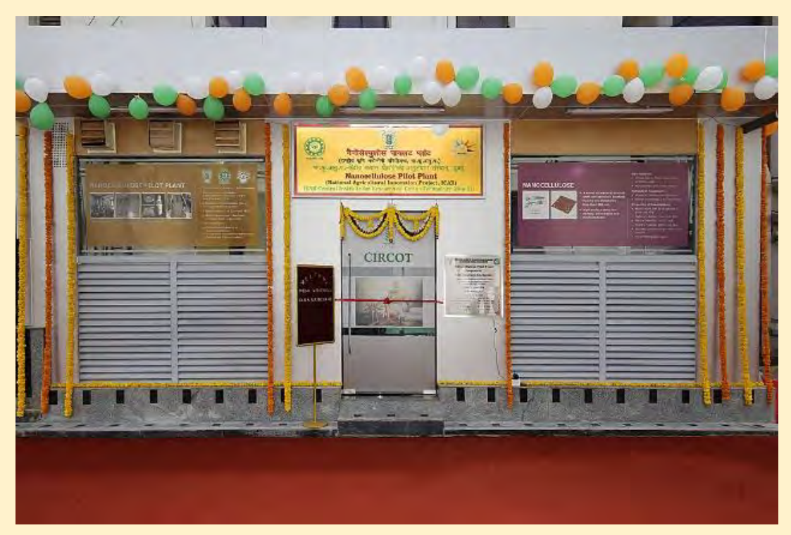
The Nanocellulose Pilot Plant at ICAR-CIRCOT