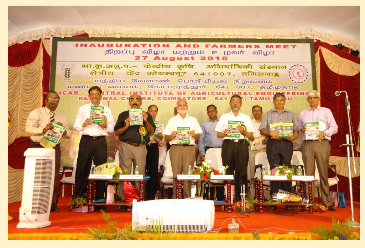
Release of Publication during Inauguration of ICAR-CIAE Regional Station, Coimbatore & Farmers Meet