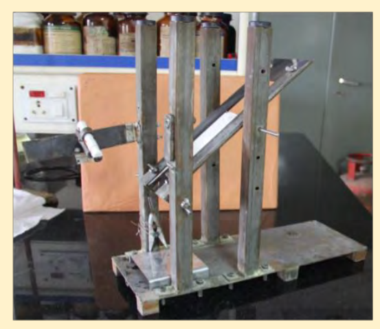
Flammability Testing Apparatus

A multiple angle flammability testing machine was designed for testing the flammability of textiles. The machine is fabricated using mild steel metallic arrangement based on diagonal scale concept. It consists of 0°(horizontal), 30°, 45°, 60° and 90°(vertical) flammability arrangement as per IS standard method. One metallic scale is attached on the fabric clamp to measure the burning rate and char length easily. A metallic ash collector is provided at the bottom of the machine to collect the ash materials after burning. Gas burner with green gas pipe is arranged in such a way to provide 38mm flame to the fabric clamped in both horizontal and vertical direction.