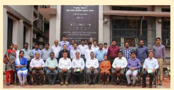
Group Photo: Training programme on Quality Evaluation of Cotton (for Cotton Breeders/Scientists)

Senior Scientist & Head I/C, TTD as Course Coordinators.