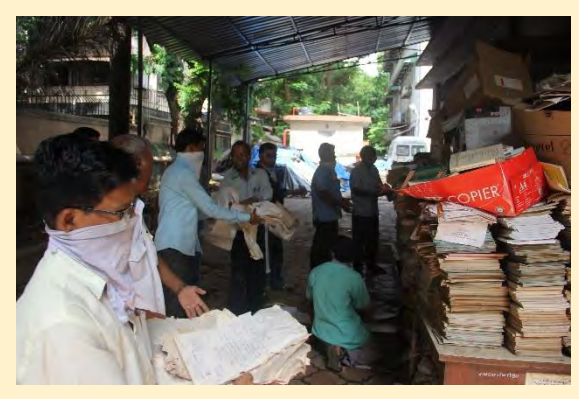
CIRCOT Staff at cleaning activities

The staff of the Institute formed a human chain and removed old files and papers from the basement of Dr. V. Sundaram Building on August 7, 2015.