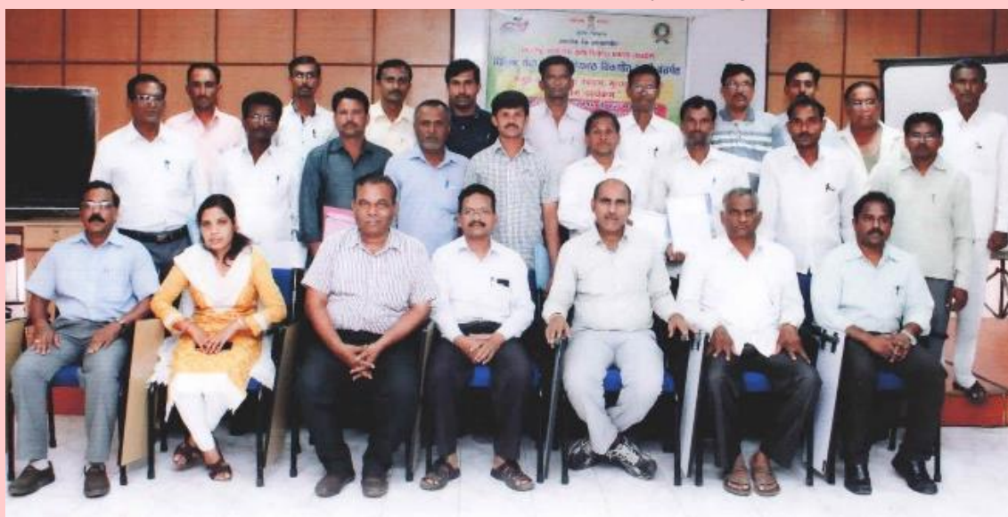
Group photo of farmers' training programme conducted at GTC, Nagpur

The training program was financially supported by Maharashtra Agricultural Competitiveness Project, MACP, ATMA, Nagpur. The training module dealt with logistics and supply of cotton stalks to industries and in-situ utilization of cotton stalks for additional remuneration and soil fertility management.