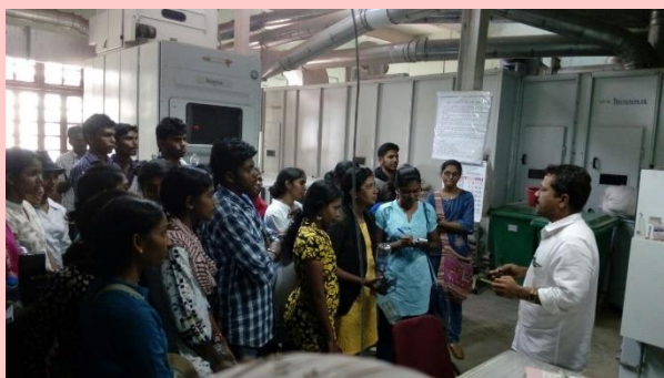
Students visited at Mechanical Processing of Cotton

Around 100 students from Kerala Agricultural University visited ICAR-CIRCOT, Mumbai on March 16, 2016.