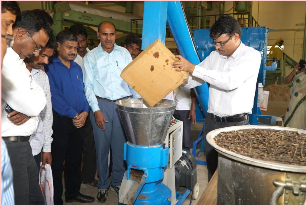
Demonstration of pelleting of cotton stalks to the farmers and stakeholders at GTC, Nagpur