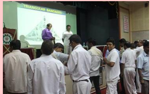
Demonstrations for SSS during the training on First Aid & Fire Fighting