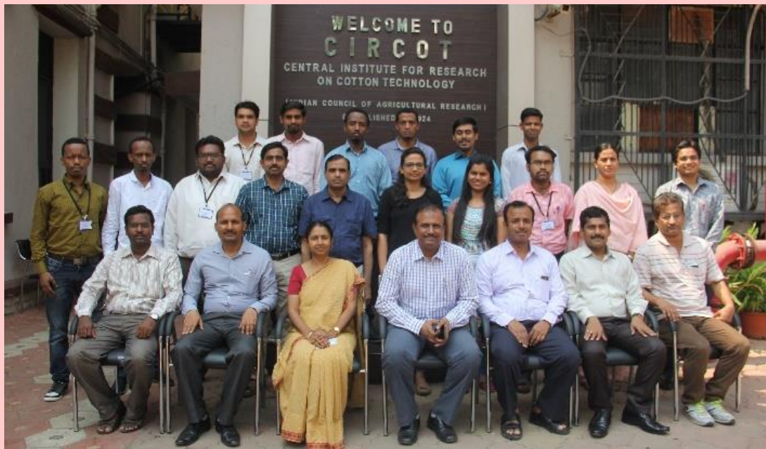
Group Photo: Training on "Spectroscopic and Chromatographic Techniques for Material