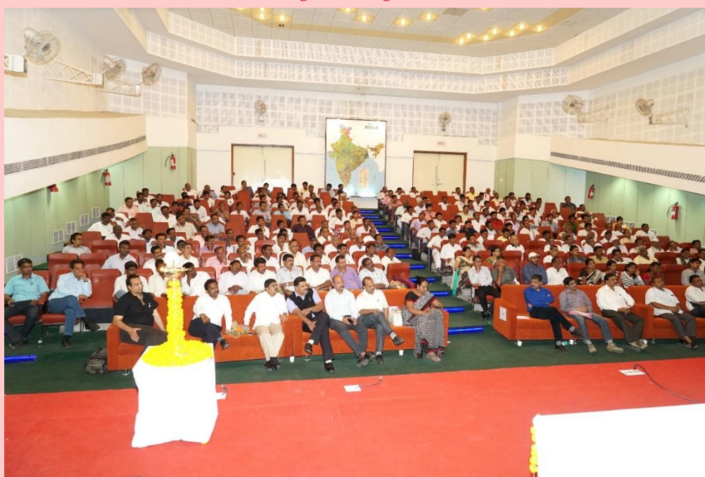
Farmers and stakeholders attending the Mela