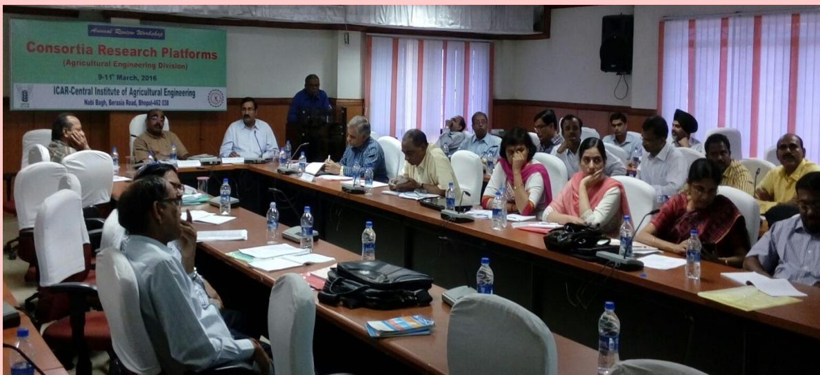
Annual review workshop of CRP projects at CIAE, Bhopal