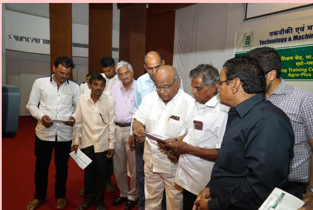
Distribution of soil health cards to farmers covered under Mera Gaon Mera Gaurav Programme