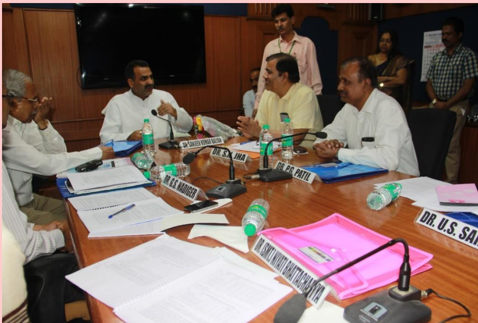
Dr. Sanjeev Kumar Balyan, Hon'ble Union Minister of State for Agriculture & Farmers Welfare, discussing with the Experts and the Scientist at ICAR-CIRCOT on 17 th March, 2016.

Dr. Sanjeev Kumar Balyan, Hon'ble Union Minister of State for Agriculture and Farmers welfare visited ICAR-Central Institute for Research on Cotton Technology, Mumbai on 17 th March, 2016. Director, ICAR-CIRCOT briefed the activities of the institute to the Hon'ble minister. Minister had a discussion with the expert members and the scientist of the institute on the recent developments in the cotton sector. Dr Balyan urged the scientists to give more emphasis on development of farmer-centric technologies. In addition, to make cotton cultivation more remunerative, development of cutting edge technologies for the industry must be accelerated. The Institute should ensure to have better coordination with industries and commercialization of technologies.