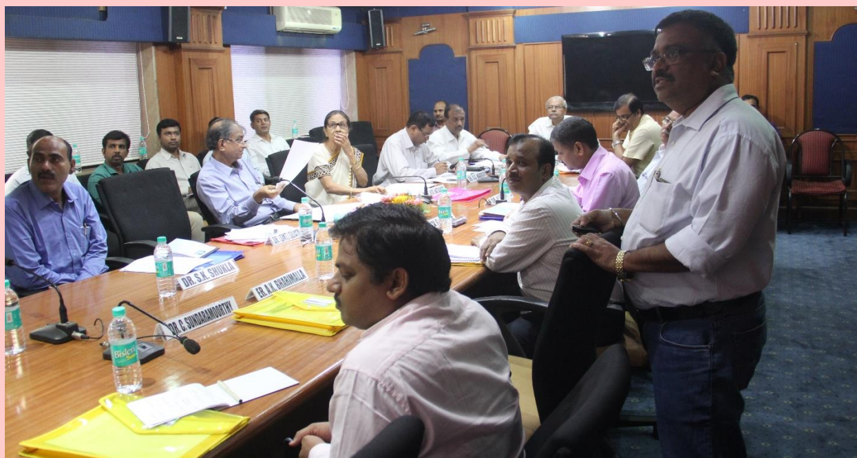
Discussion during XXII RAC Meeting