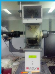
Tensiometer cum Goniometer

Interest in the wetting characteristics of fibers has increased greatly in recent years. Much of this new interest involves the study of fiber reinforced composites. The successful use of fibers in composite materials depends on the adhesion of the fibers into the matrix material. The quality of the adhesion is in turn dependent on the wetting of the fibers by the matrix. Characterization of this wetting is done by contact angle determinations.