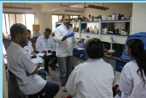
Practical session in Nano Lab