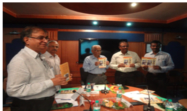
Release of the publication “Electro spinning Facility at CIRCOT”