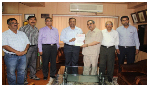
Signing of MoU with M/s Zenith Industrial Rubber Products

Under a subproject of National Agricultural Innovation Project (NAIP) entitled “Design and development of rubber dams for watersheds” implemented by consortium comprising of Directorate of Water Management (DWM), Bhubaneswar, Central Institute for Research on Cotton Technology (CIRCOT), Indian Rubber Manufacturers Research Association (IRMRA), Mumbai and Kusumgar Corporates Private Limited (KCPL), Mumbai, a Technology for manufacturing & Installation of “ICAR flexi check dams” for the effective watershed management and efficient use of water in Agriculture has been developed. To commercialize the developed technology, a Memorandum of Understanding has been signed on non-exclusive basis to manufacture and sell the “Textile Reinforced Rubber Composite Sheets” with M/s Zenith Industrial Rubber Products Pvt. Ltd., Mumbai on 3 rd November, 2014 at ICAR-CIRCOT.