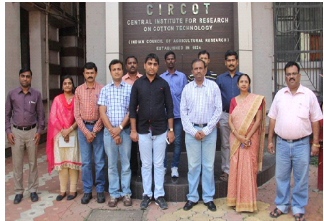
Director CIRCOT and faculty members with the trainees