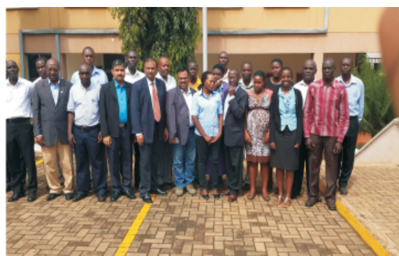
ICAR-CIRCOT Team with delegates of Uganda at Cotton Development Organization, Kampala