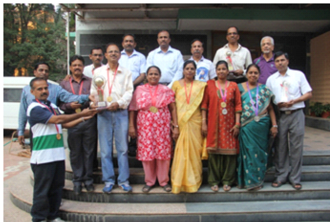
Medal winners with Director, CIRCOT