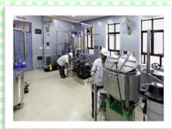
Nanocellulose Pilot Plant

Nanotechnology deals with the manipulation of atoms, molecules, or molecular clusters into functional structures to create functional materials and devices of vastly different properties. The first use of the concept of 'nanotechnology' was in " There's Plenty of Room at the Bottom ", a talk given by physicist Richard Feynman in 1959. ICAR-CIRCOT, a leader in the field of nanotechnology applications in agriculture & allied sectors, cotton textiles, sensors and biocomposites, has over two decades of experience and expertise in nanomaterials synthesis, characterization and applications. In 2015, India's first Nanocellulose Pilot Plant was commissioned and dedicated to the nation. On the occasion of Centenary Year (2023-24) celebration, this nanotechnology training is being organized to impart basic and advanced knowledge of nanotechnology and its applications in agriculture and allied sectors.