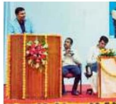
One of the dignitaries addressing during the event.

The ICAR-Central Institute for Research on Cotton Technology (CIRCOT), Mumbai, and the Cotton Textiles Export Promotion Council (TEXPROCIL), Mumbai, organised