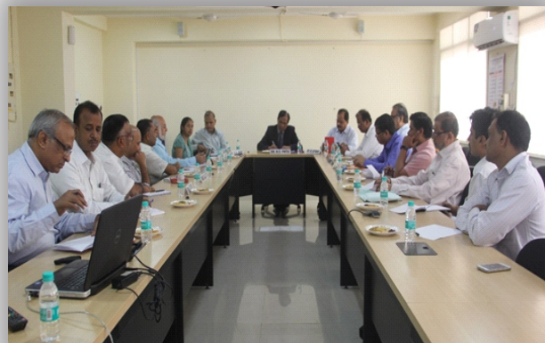
Interactive meet of QRT members with CIRCOT stake holders