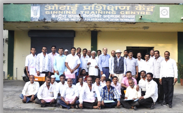
Group photo of farmers training held at GTC, Nagpur during November, 2017

Farmers' training on “Cotton Production and Post-Harvest Processing” was conducted at GTC, Nagpur twice during the month of November, 2017. A total of 69 progressive farmers from Jalgaon district of Maharashtra attended the training programme sponsored by ATMA.