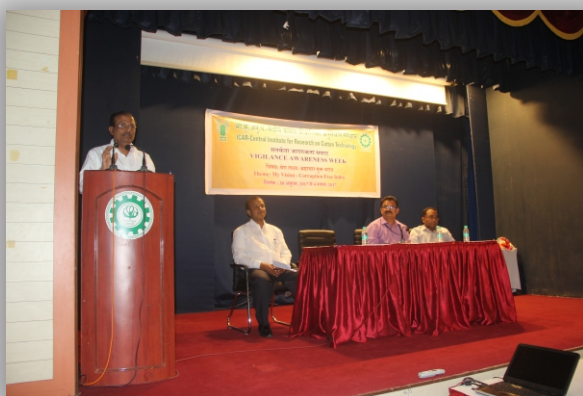
Vigilance Awareness Week-2017 observed at ICAR-CIRCOT Mumbai