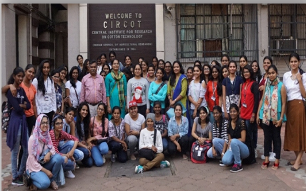
Visit of girl students from St. Francis College, Hyderabad

Girl students from Dept. of Biochemistry, St. Francis College, Hyderabad visited the Institute on November 20, 2017. They visited the nano lab in chemical and biochemical processing division to understand the nano particles preparation process. They were briefed about use of nanotechnology in cotton and allied sectors.