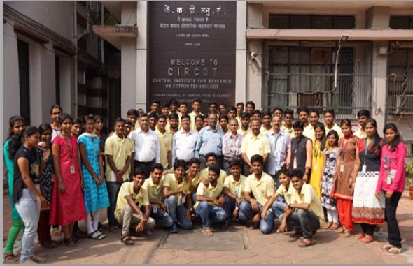
Visit of students from College of Agricultural Engg., Raichur

Students of College of Agricultural Engineering, Raichur (UAS, Raichur) visited the Institute on November 17, 2017. They were briefed about various tests carried out in FT, YT and MPD of the Institute. Demonstrations were given to them to understand the basic concepts of cotton processing.