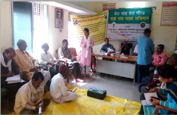
MGMG Programme at Shegaon (Kund), Wardha