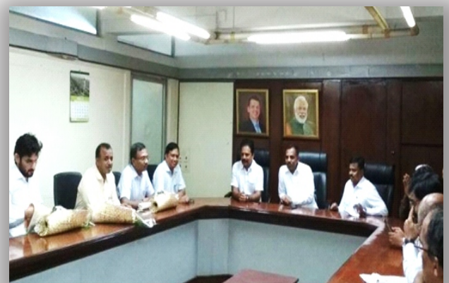
ICAR-CIRCOT scientists interacting with the APMC officials at Pune