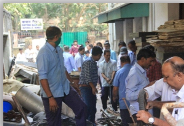
Cleanliness being carried out in the Institute campus premises

As a part of the implementation of the Swachh Bharat Mission, a cleanliness drive was arranged in the CIRCOT, Mumbai premises on November 15, 2017. Articles kept near the pump house for condemnation/disposal were segregated and stored for further disposal through auction. The work was accomplished in a team spirit by forming a human chain. All the staff members enthusiastically participated in the cleaning programme.