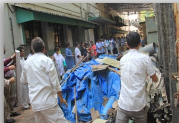
Cleanliness being carried out in the Institute campus premises