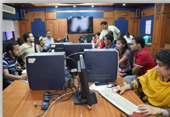
Participants getting hands-on training on statistical tools