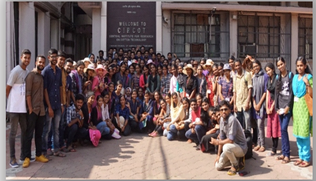
Visit of students from College of Agriculture, Vellayani, Thiruvananthapuram

Students from College of Agriculture, Vellayani, Thiruvananthapuram (Kerala Agril. University), visited the Institute on November 28, 2017. They were briefed about CIRCOT history and mandate. They were also told about various specialized training courses conducted by CIRCOT. A visit to FT, YT and MPD sections was arranged to explain about the cotton processing technologies.