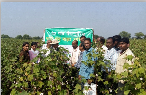
Field visit during MGMG Programme at Sawali (Wagh) village, Wardha