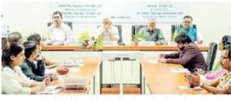
राष्ट्रीय कृषी विकास केंद्र येथे आयोजित एका दिवसीय कार्यशाळेत उपस्थित मान्यवर.