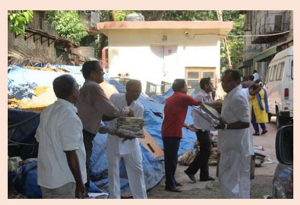
Cleaning work by CIRCOT Staff members

The staff of the Institute formed a human chain and removed old files and unserviceable items, files from basement area of MS building, CIRCOT on 25<sup>th</sup> April, 2015.