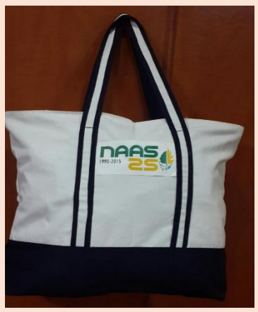
Multipurpose Cotton Bag

Multipurpose Cotton bag has been designed by the institute for distribution as a registration kit during the Silver Jubilee Celebration of National Academy of Agricultural Sciences (NAAS), New Delhi to be held during June 2-5, 2015.