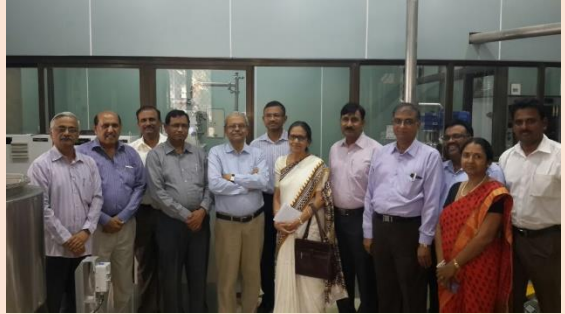
RAC Chairman and Members at Nanocellulose pilot plant