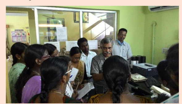
Students Visit at CIRCOT Regional unit, Coimbatore

Demonstration of the cotton testing facilities available at the centre to Sixteen M.Sc (Agri)-agronomy students from TNAU, Coimbatore on 23<sup>rd</sup> April, 2015.