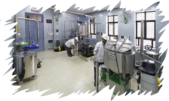
Nanocellulose Pilot Plant, Mumbai