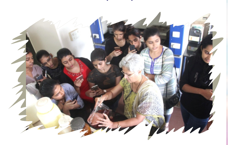
Experiments on dyeing of cotton with manjishtha