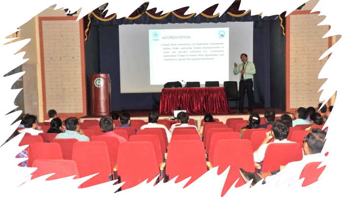
NABL Training at ICAR- CIRCOT on December 27, 2017

One day NABL accreditation awareness programme (including notification of Toys testing) was held on December 27, 2017 at ICAR-CIRCOT, Mumbai. The programme was jointly organized by National Accreditation Board for Testing and Calibration. Laboratories, New Delhi; Indian Rubber Manufacturers Research Association (IRMRA), Thane and ICAR-Central Institute for Research on Cotton Technology, Mumbai. The objective of the programme was to acquaint the trainees about NABL accreditation and toys testing methods. Forty participants from different NABL accredited laboratories attended the training programme. Fourteen staff members from ICAR-CIRCOT participated in this training program