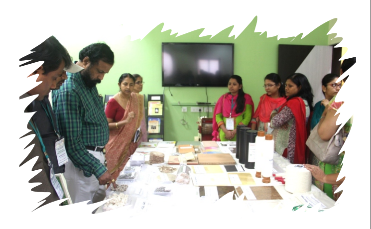
Participants being explained about various exhibits in exhibition room