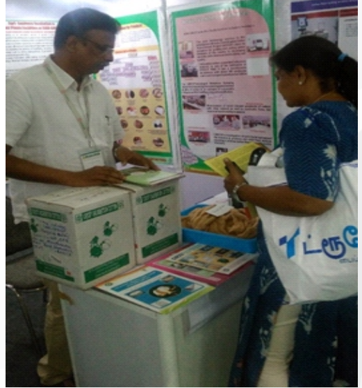
ICAR-CIRCOT stall at AGRI INTEX-2017

ICAR-CIRCOT participated and showcased its technologies, skill development programs and Agri-Business Incubation facilities in one day Indo-Global Education and Skill Expo-2017 organized by the Indus Foundation on July 17, 2017 at The Lalit Hotel, Santacruz, Mumbai.