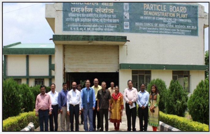
The QRT members along with GTC scientists at the particle board plant