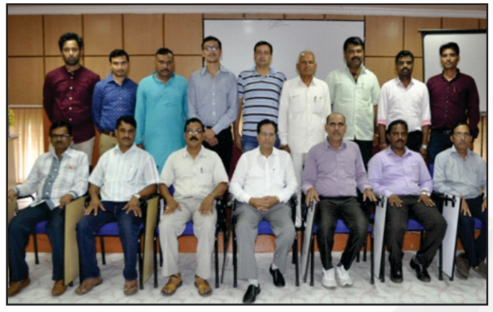
Participants of the training program on "Double Roller Ginning Technology and Basics of Cotton Grading" during July 10-15, 2017 at GTC, Nagpur

Ginning Training Centre, Nagpur organized a one week training program on "Double Roller Ginning" Technology and Basics of Cotton Grading" during July 10-15, 2017. Nine participants representing ginning industries from Maharashtra, Gujarat, Madhya Pradesh and Haryana attended the training program. The training course covered various aspects such as fibre quality assessment like fibre length, strength, fineness and maturity, cotton trading and marketing, DR ginning technology, automation & ginning settings, repairs and maintenance of ginning and pressing machinery, humidification in ginning system, cotton by-product utilization etc. Guest lectures on cotton trading, cotton marketing, preengineered building structures for cotton and bale storage were delivered by invited experts. The trainees were taken for industrial visits to M/s Bajaj Steel Industry & M/s Sri Bhagirath Textiles Ltd.