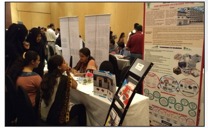
ICAR-CIRCOT stall at Indo-Global Education and Skill Expo-2017

ICAR-CIRCOT participated and showcased its technologies, skill development programs and Agri-Business Incubation facilities in one day Indo-Global Education and Skill Expo-2017 organized by the Indus Foundation on July 17, 2017 at The Lalit Hotel, Santacruz, Mumbai.