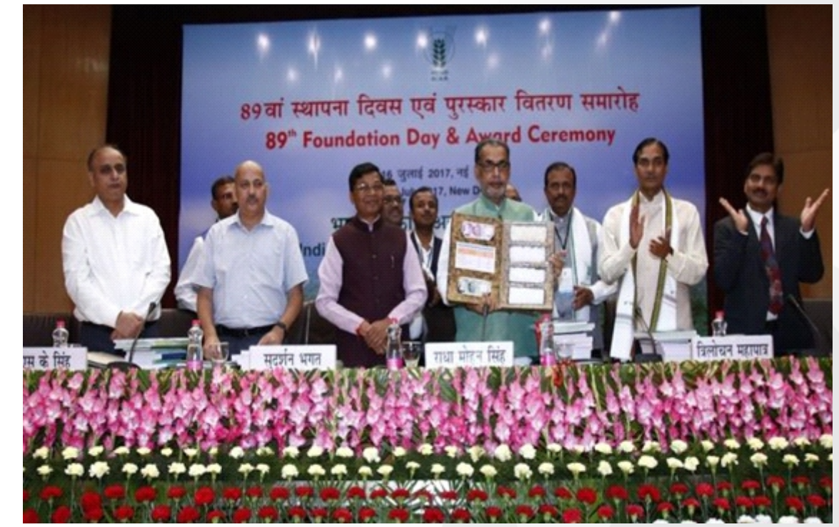
CIRCOT Paper Pulp Technology released during the ICAR Foundation Day Celebrations on July 16, 2017

A 'Paper Pulp Technology' for preparation of high quality currency grade paper from cotton has been developed by a multi-disciplinary team of scientists at the Institute. The paper made by this technology can be used for producing high quality currency grade paper, which has the durability twice as that of the present currency notes. The paper produced at the Institute was tested by the Security Paper Mill, Hosangabad. This technology was released on the 89<sup>th</sup> ICAR Foundation Day ceremony on July 16, 2017 at NASC Complex, New Delhi by Shri. Radhamohan Singh, Hon'ble Union Minister of Agriculture and Farmers' Welfare in presence of the DG and top officials of the ICAR. Dr. P. G. Patil, Director, ICAR-CIRCOT and the multidisciplinary research team attended the function and the technology release event.