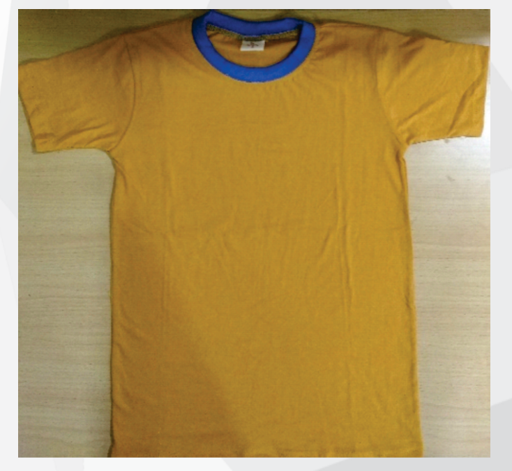
Cotton/Bamboo/PLA blended garment