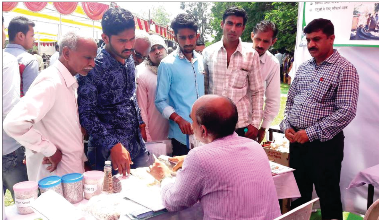
ICAR-CIRCOT's stall at Kisan Mela, Nagpur

• Ginning Training Centre, Nagpur participated in Kisan Mela organized at ICAR-CCRI, Nagpur on March 17, 2018 in connection with the Krishi Unnati Mela at New Delhi. The stall setup by ICAR-CIRCOT was visited by over 1100 farmers and over 100 officials.