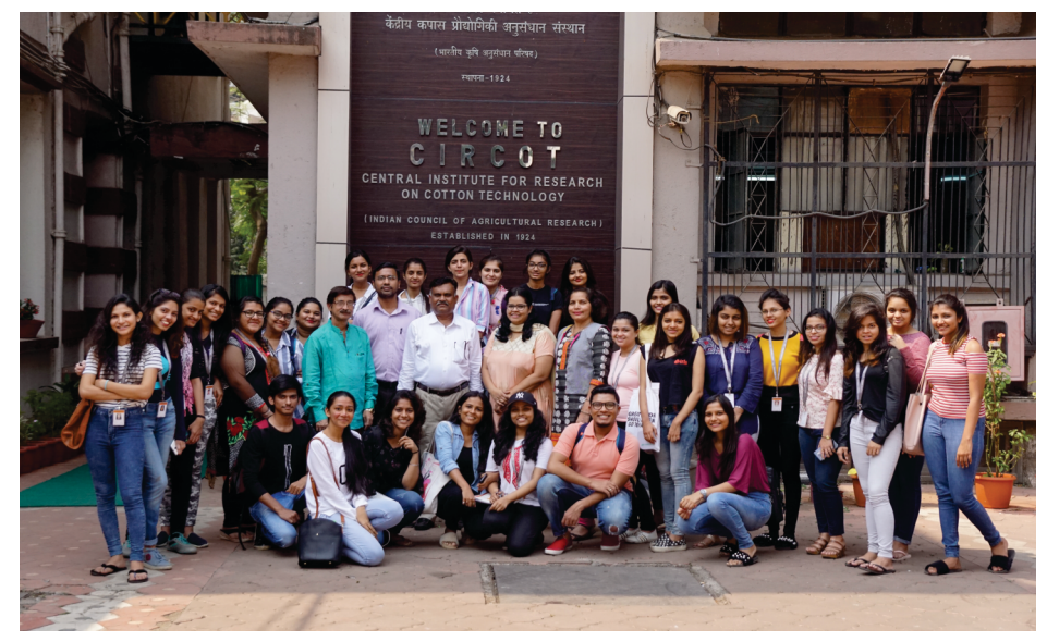
Students of Mithibai College, Vile Parle, Mumbai at ICAR- CIRCOT

Twenty eight students from Biotechnology Department of Mithibai College, Vile Parle, Mumbai visited ICAR- CIRCOT on March 23, 2018. They visited SEM, AFM and Nanotechnology labs. They were briefed about the institute activities and specialized training courses being organized in the institute.