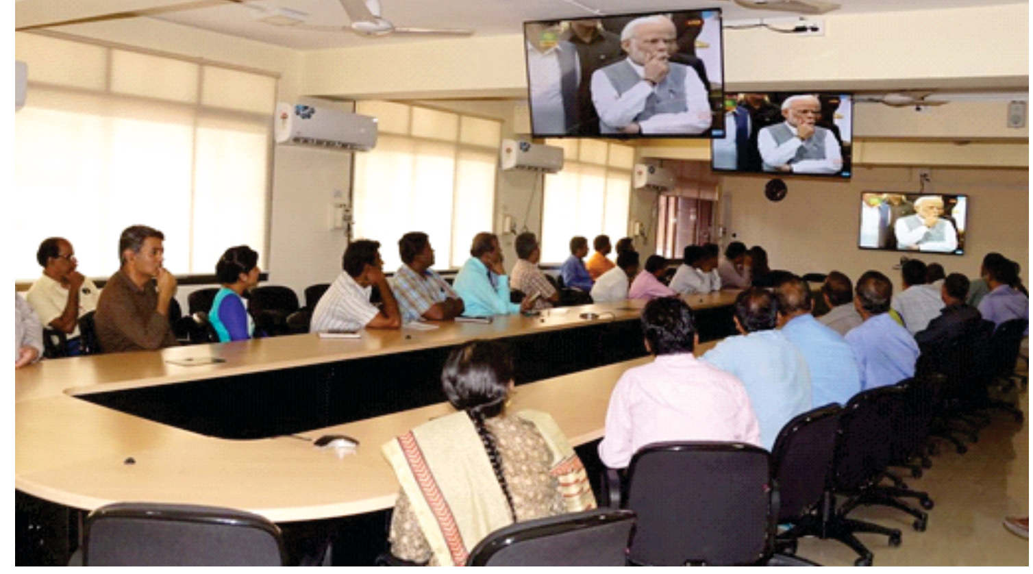
Live webcast of inaugural function of Krishi Unnati Mela-2018