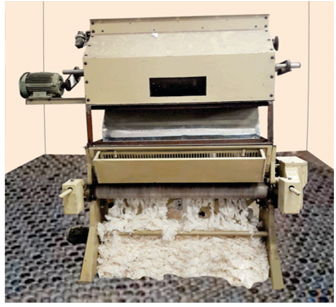
Spike cylinder single locking cotton feeder was developed at ICAR-CIRCOT

energy. Optimum moisture level of 7.38 & 7.15 % and spike cylinder speed of 307 & 297 RPM with desirability of 0.9185 & 0.8923 was arrived using multiple regression analysis for long and medium staple cotton respectively. Use of single locking cotton feeder for long and medium staple cotton resulted in 22 & 25 % increase in ginning output and 12 & 13.5 % reduction in specific energy requirement respectively as compared to conventional system comprising of auto feeder. Single locking feeder showed significant improvement in colour grade of cotton. Other HVI and AFIS fibre quality parameters remained unaffected. With these advantages, single locking feeder would be highly useful for cotton ginneries.