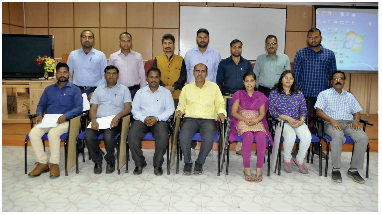
Group Photo- Training programme on '"Cotton Quality Assessment, Grading and Marketing"

promotion of cotton cultivation and quality based marketing in the state. The training programme covered practicals and lectures on cotton quality parameters, manual stapling, grading, marketing, operation of different testing equipment, etc. Besides, trainees were also provided detailed information about the facilities and infrastructure needed to establish a cotton testing laboratory.