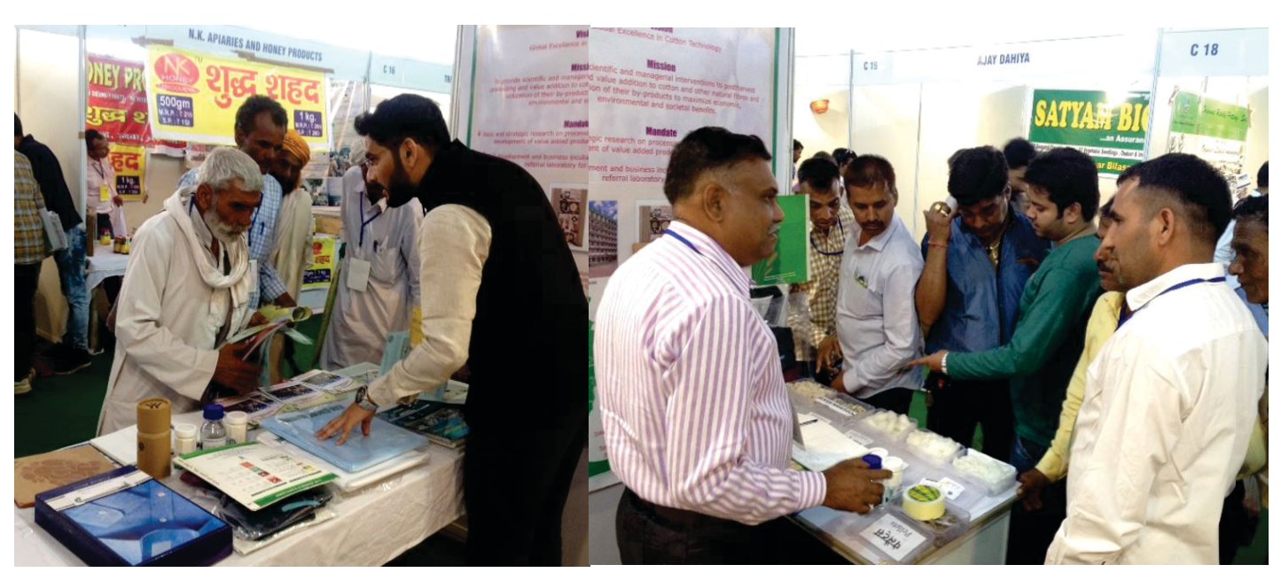
ICAR-CIRCOT's stall at Krishi Unnati Mela, New Delhi

ICAR-CIRCOT participated in exhibition of Krishi Unnati Mela 2018 at New Delhi held during March 16-18, 2018. The main objective of this fair was to expand the potential of agriculture and also double the income of farmers by 2022. Krishi Unnati Mela was inaugurated on March 16, 2018 by the Union Minister of Agriculture and Farmers Welfare, Shri Radha Mohan Singh. The Honorable Prime Minister, Shri Narendra Modi, addressed the Krishi Unnati Mela on March 17, 2018. Over 800 stalls were set up by the Central and State Governments, various organizations in the fair. Large number of farmers from across the country visited the fair and gained useful knowledge and information. About 25 thousand farmers attended the first day of the fair.