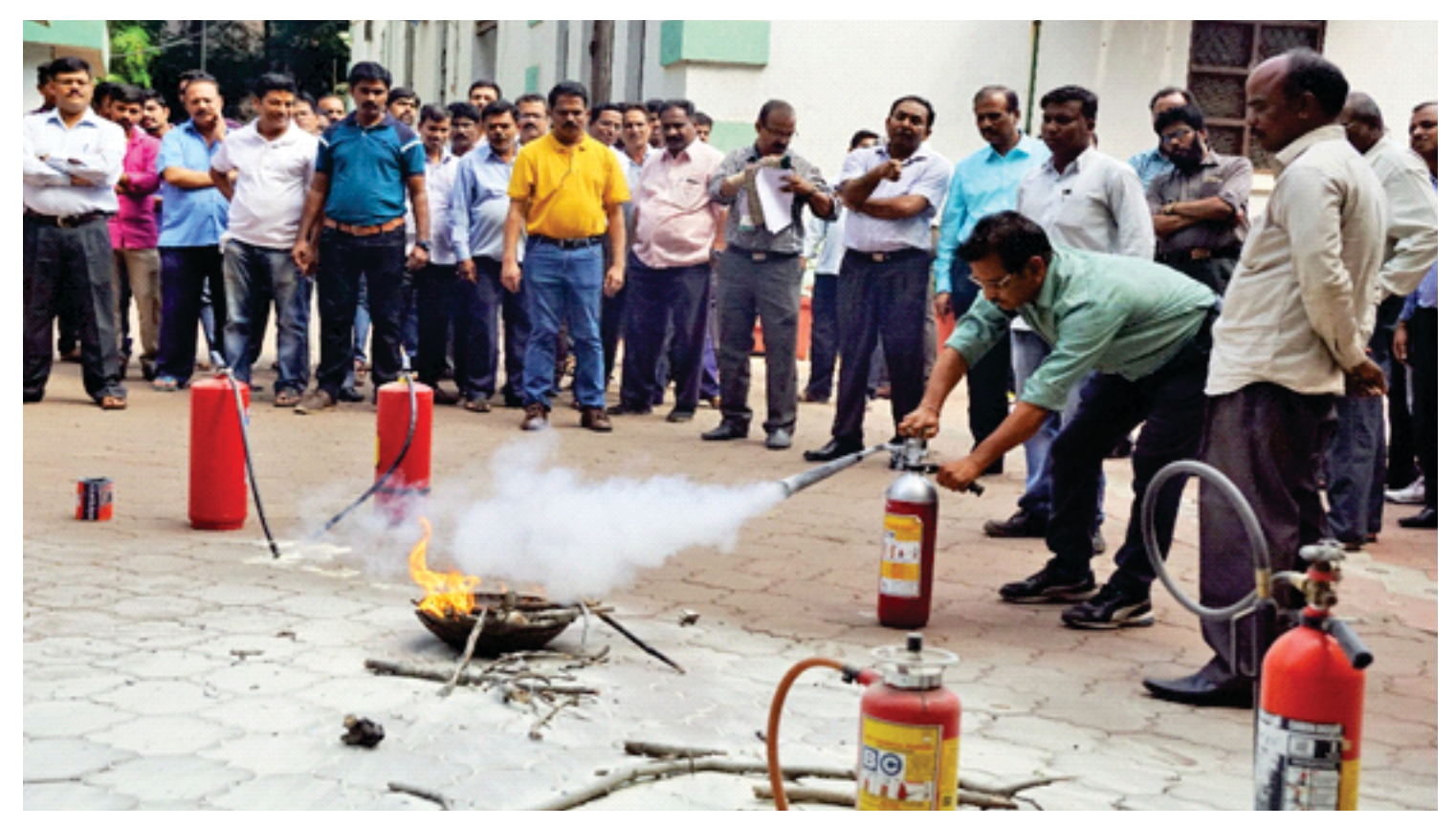
Firefighting demonstration on March 17, 2018

operation of fire extinguishers. The demonstration was conducted by Nishant Enterprises, Thane.