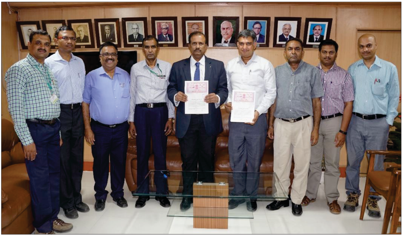
MoU signing with M/s Forech Mining & Construction International LLP, New Delhi

• Memorandum of Understanding (MoU) was signed with M/s Forech Mining & Construction International LLP, New Delhi for licensing the technology to manufacture Technical Textile Reinforced Rubber Composite Sheet for making "ICAR Flexi-Check Dam" on March 27, 2018.