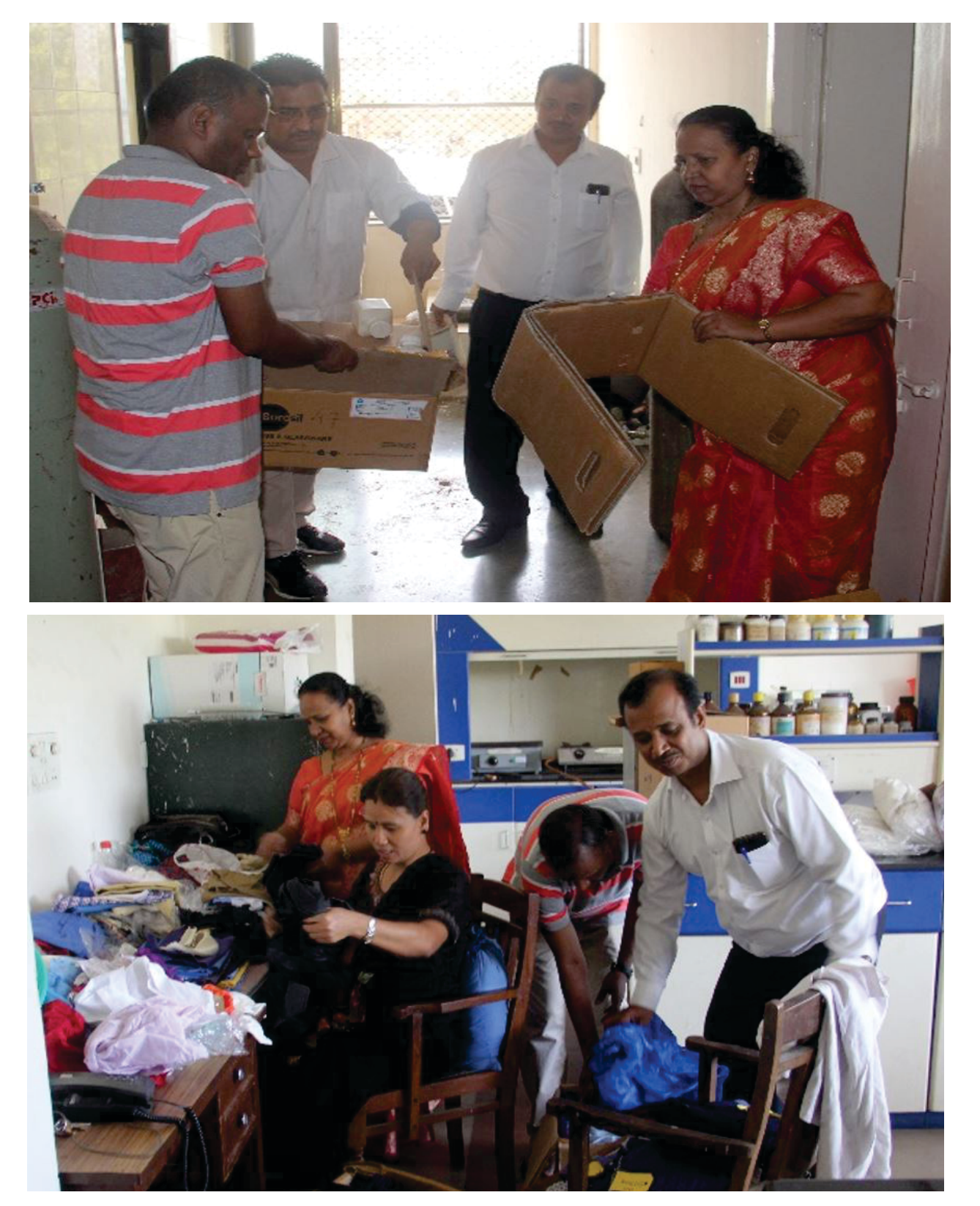
CPBD staff during the cleaning programme

CBPD staff. The waste cotton and fabric samples left out after testing were removed, filled in the boxes for proper disposal. All the staff members of CBPD participated in the cleaning programme.