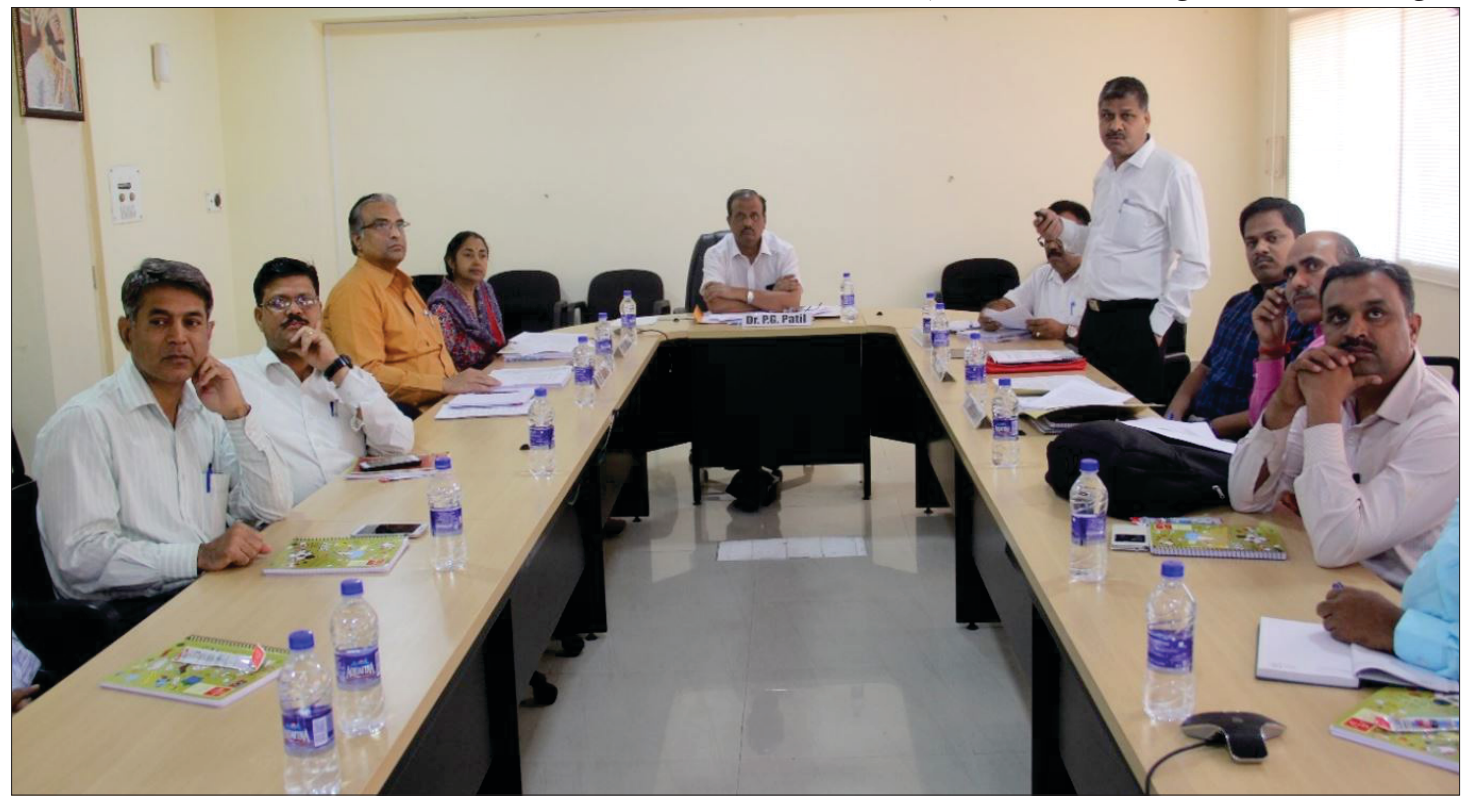
118<sup>th</sup> IRC meeting at ICAR-CIRCOT

that the scientists should strengthen the research consultancy and bring in Industry partners to collaborate in their research projects for the ease of technology commercialization. The achievement of the Institute in revenue generation (> Rs. 1.5 crore) and the efforts of GTC, Nagpur for its contributions (> Rs. 50 Lakhs) were acknowledged in the meeting.