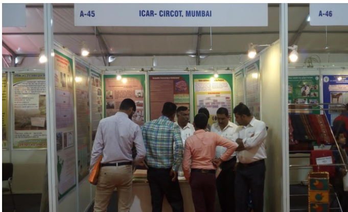
Students, Entrepreneurs and Businessmen at ICAR-CIRCOT stall at New Delhi