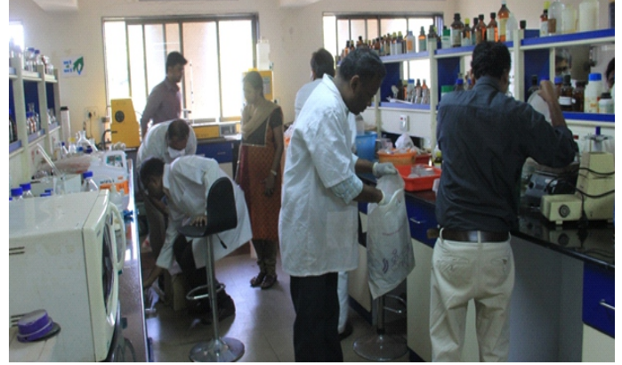
Cleaning and arrangement of chemical bottles, feed stock and consortia in CBPD under Swachh Bharat Abhiyaan on April 13, 2017

The unwanted materials like empty chemical bottles, unused and broken glass wears were taken out and stored properly for further disposal. All the staff members of CBPD and research students participated actively and enthusiastically in this cleaning programme.