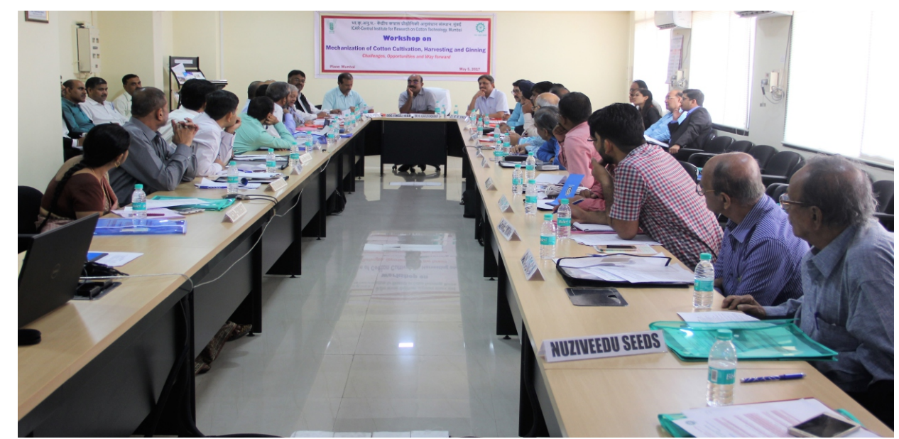
Deliberation on "Mechanization of Cotton Cultivation, Harvesting and Ginning: Challenges, Opportunities and Way Forward" with the stakeholders