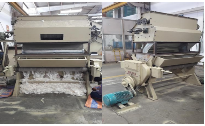
Single locking cotton feeder with DR gin

for Double Roller Gin Cotton feeding mechanism to DR gin significantly affects ginning efficiency. Therefore to improve the feeding, an automatic single locking cotton feeder which regulates feed rate and ensures single locking of cotton & feed continuous batt of cotton at the ginning points across the knife edges of DR gin was designed. It was designed with three different mechanisms viz 1) saw band cylinders with twin regulator and apron 2) spike cylinders and feed roller 3) combination of both. First mechanism consists of twin regulator assembly with sensor controlled regulated feeding, saw band cylinder assembly for single locking of seed cotton and apron for uniform feeding of single locules at ginning point. Second mechanism consists of a pair of feed roller, pair of spiked cylinders and grid bar housed in a hopper, chute for cotton distribution on either side of DR gin. Third mechanism is a combination of the first and second mechanisms which comprises of feed roller, spike cylinders with saw band cylinders and apron, power transmission and main frame assembly. Prototypes of single locking cotton feeder with three designs have been developed and is under testing.