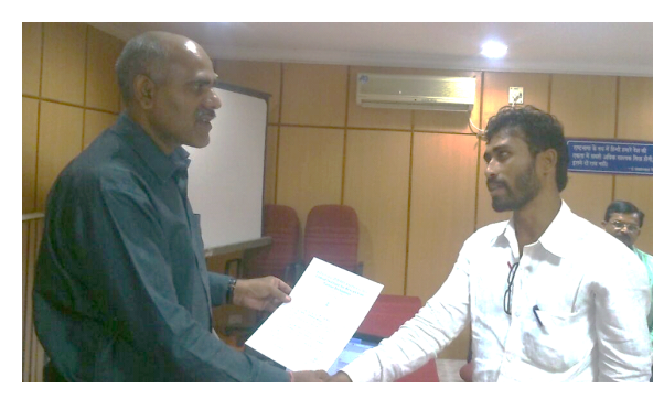
Distribution of certificates to the Participants

Ginning Training Centre (GTC) of ICAR-CIRCOT, Nagpur organized a training programme on 'Double Roller Ginning and Cotton Quality Evaluation' during 29<sup>th</sup> Sep to 4<sup>th</sup> Oct 2014 for cotton ginners, traders and gin managers. Trainees from different parts of Maharashtra participated in this programme. A series of in-house and guest lectures on different aspects of cotton quality assessment, grading, cotton marketing, by-product utilization etc. were arranged during the training programme. Hands on training on gin settings, automation, stapling of cotton, etc.