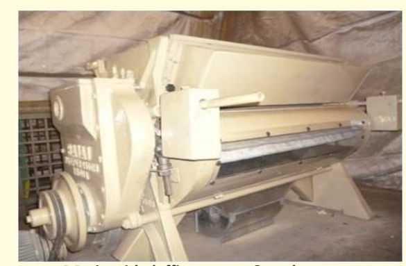
DR gin with doffing system & enclosures

An automatic lint doffing system and an enclosure of the DR gins were designed, developed and evaluated to arrest the fine particles that emanate from the ginning point of the DR gins. The automatic lint doffing