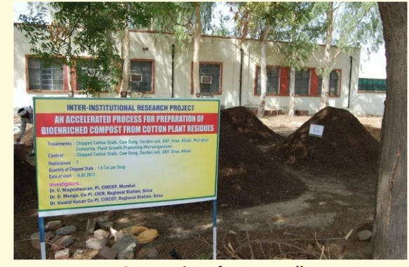
Composting of cotton stalk

Cotton stalk is one of the abundantly available agro biomass and approximately 30 million tonnes are available in India annually. Burning it in the field after harvest leads to pollution. One of the viable alternative solution for it's utilization is composting. Cotton stalks is one of the high lignin containing (20-25%) agro residues. Conventionally, the composting of high lignin containing residues will take minimum four to six months for production of good compost. At CIRCOT an accelerated a process has been developed for preparation of good quality compost from cotton stalks which takes about two months.