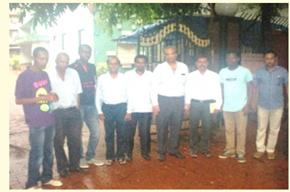
Delegates from EIAR with CIRCOT staff

A group of delegates from Ethiopia Institute of Agricultural Research (EIAR), accompanied by the officials from Nirmal Seeds, Maharashtra visited CIRCOT on 12<sup>th</sup> July 2014. CIRCOT's research and development activities were explained to the visitors. They showed great interest in garment technology and gossypol free cottonseed cake preparation besides application of nano technology in the field of agriculture.